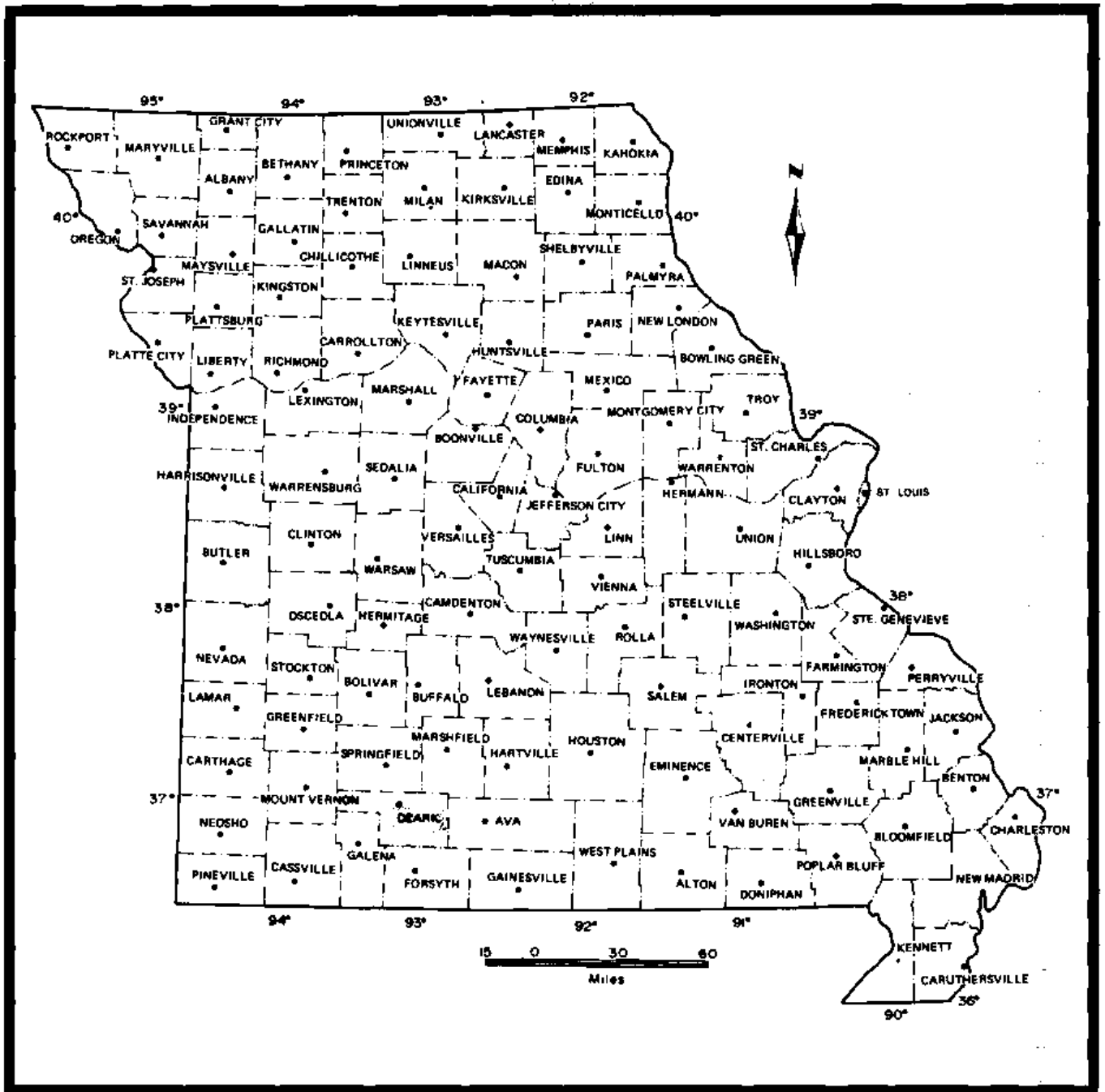
Figure 1. Christian County, Missouri. Ozark, Christian County seat.