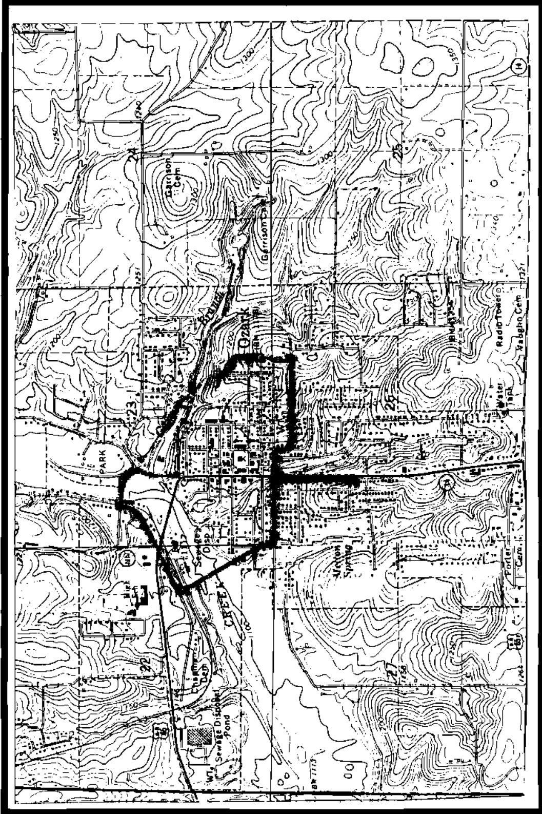
Figure 2. Ozark USGS Quad, 7.5 min, T27N, R21W, Sections 22, 23, 24, 25, 26, 27. Survey Area Highlighted.