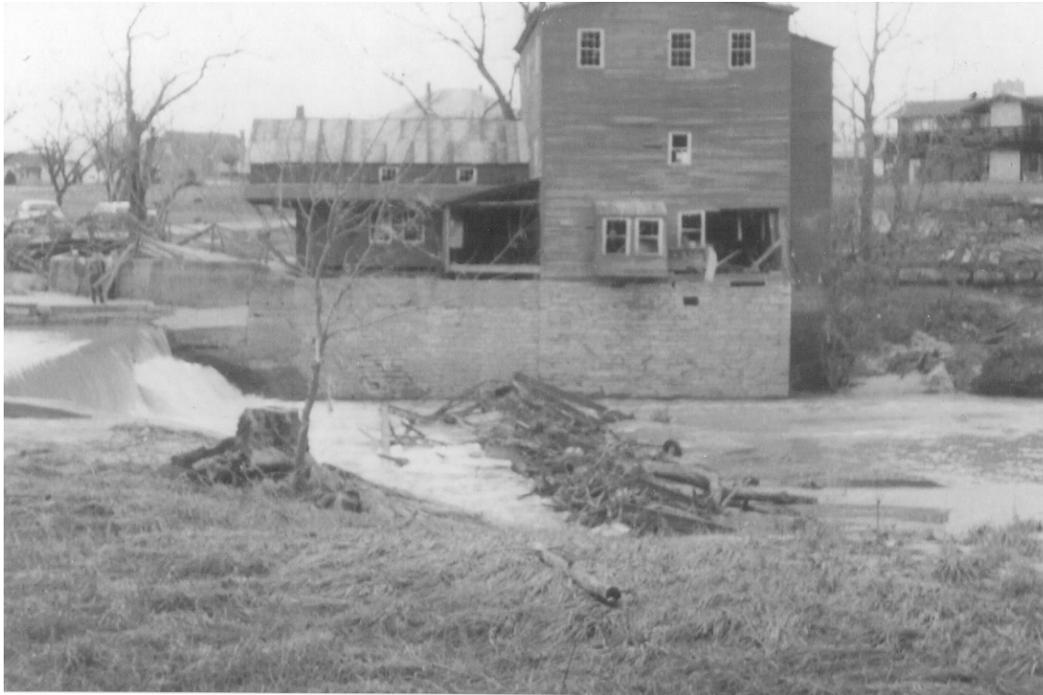
Pieces of the Old Appleton Bridge in Apple Creek after the flood Cape Girardeau County, MO

Old Appleton Bridge Cape Girardeau and Perry Counties, MO