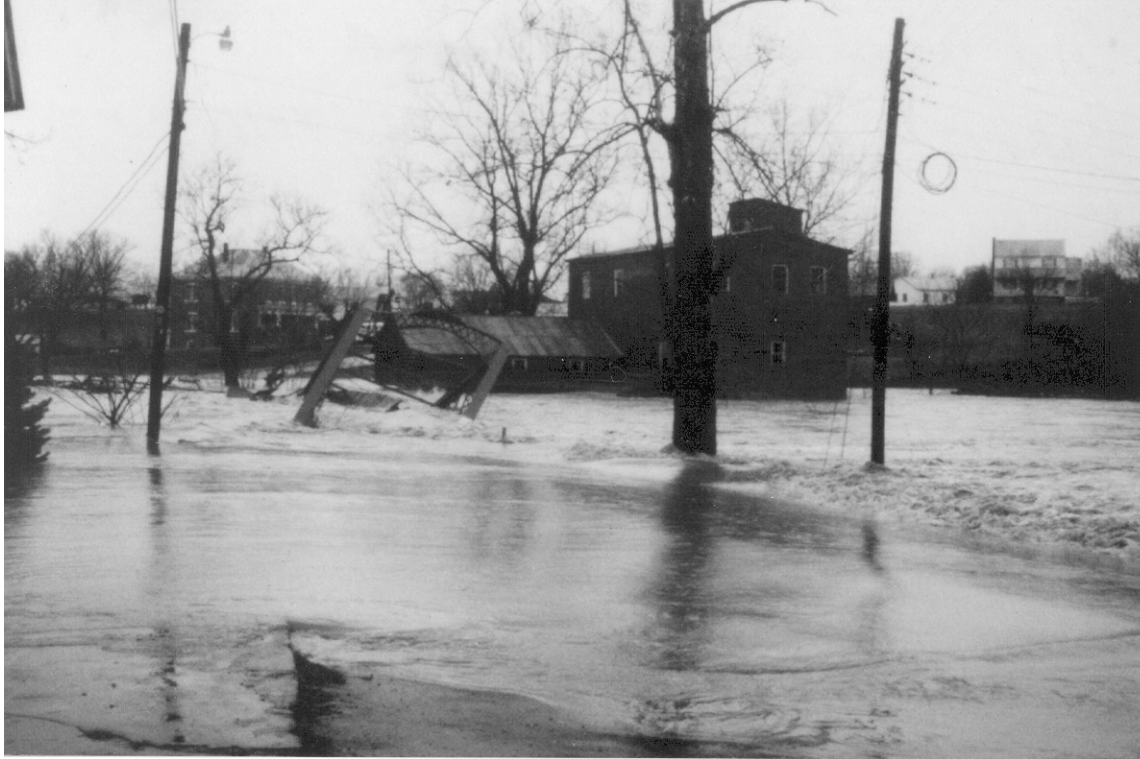
Old Appleton Bridge falling over due to flood water (During the flood of 1982) Cape Girardeau County, MO

Old Appleton Bridge Cape Girardeau and Perry Counties, MO