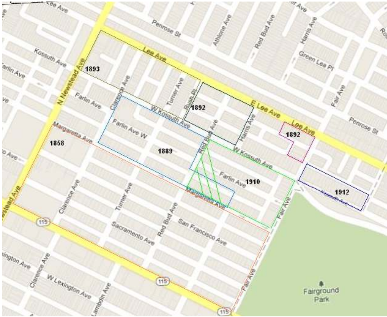
Figure 1. Subdivisions