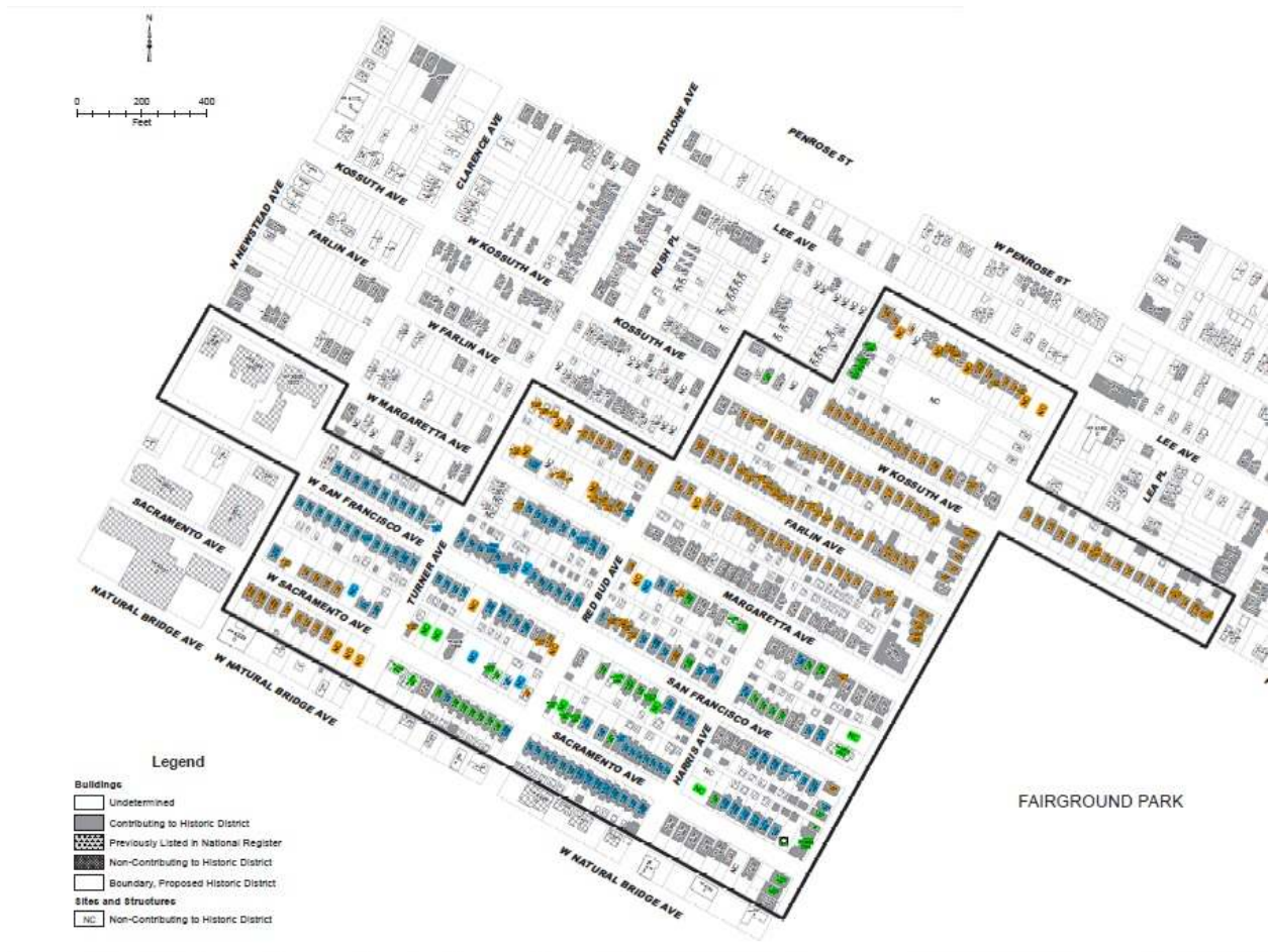
Figure 5: Survey map coded to show distribution of population in 1920 Census. Yellow denotes Caucasian household, green denotes African-American household and blue denotes addresses that were not recorded (buildings not yet built).