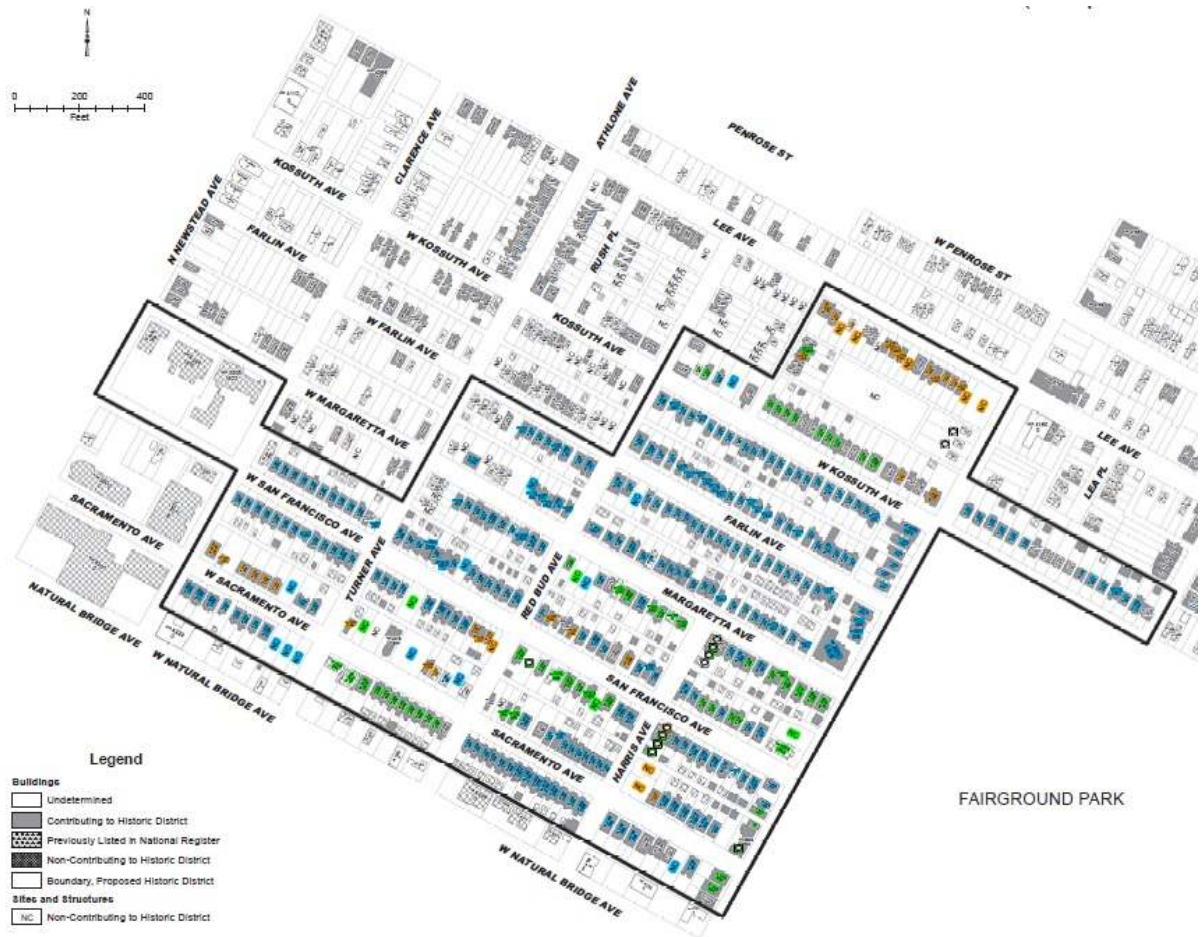
Figure 4: Survey map coded to show distribution of population in 1910 Census. Yellow denotes Caucasian household, green denotes African-American household and blue denotes addresses that were not recorded (buildings not yet built).