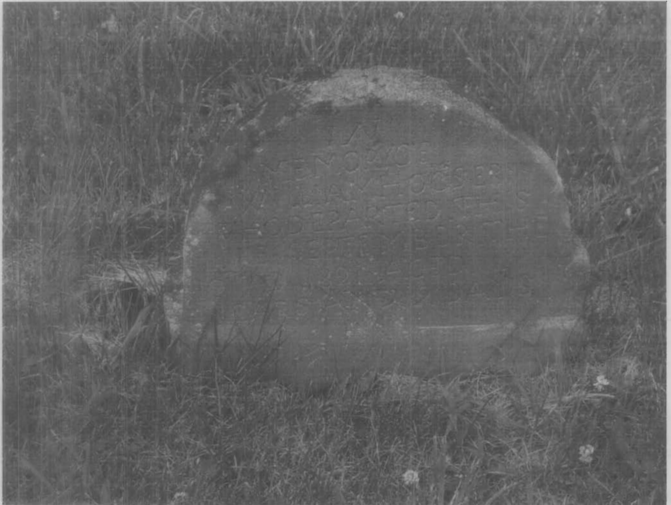
Figure 2: Hand carved stone for William Hooser, first person to be buried in McKendree Cemetery.

McKendree Chapel (Boundary Increase) Cape Girardeau County, MO