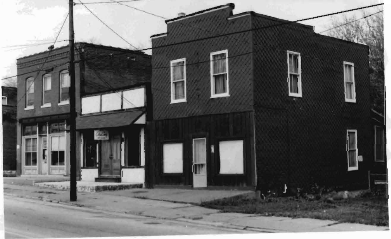
745, 747 and 749 Marshall Avenue today.