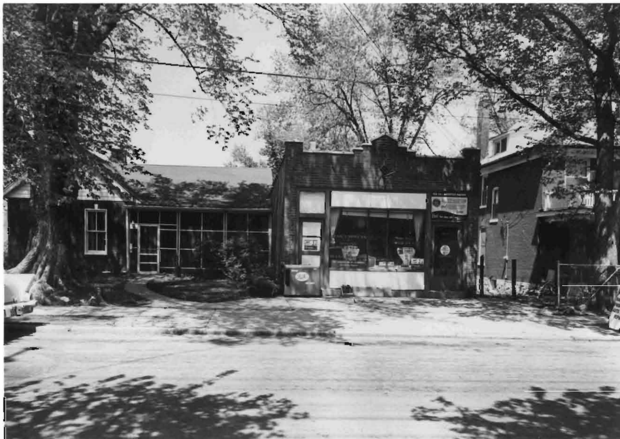
Old Robyn house, 717 Marshall Avenue, built 1909 and Conway's Confectionary, 719 Marshall Avenue, built 1925. Photograph taken 1962, courtesy of Bob Wood.

In 1925 Burdette and Caroline Conway were living in the little Robyn house at 717 Marshall Avenue and they had a small, one-story, brick store added onto the east side of their house - Conway's Confectionary. 39