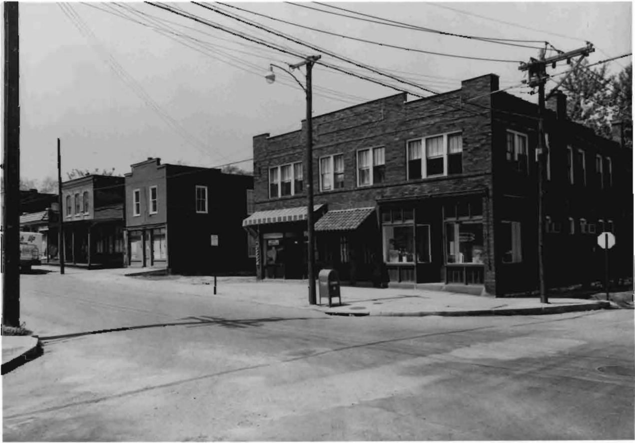
Gebelien's Dry Goods Store, 753 and 755 Marshall Avenue, built 1922.