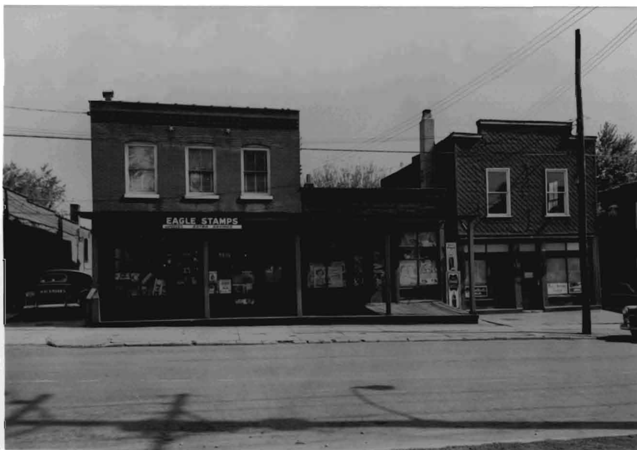
Hughs Grocery (later Hackmann's Groceries and Meats), 745 and 747 Marshall Avenue, built 1905 and Burney's Confectionary, 749 Marshall Avenue, built 1890.

Highlands, but its more important orientation was toward the northeast and Maplewood. Maplewood was a large commercial area and it was close. People from Tuxedo Park rode the Manchester Line to Maplewood to shop or to work more often than they went to the commercial area of Webster Groves. 24 A streetcar stop and shelter at Marshall Avenue and Summit created a strong potential market for convenience stores in Zeta Dell.