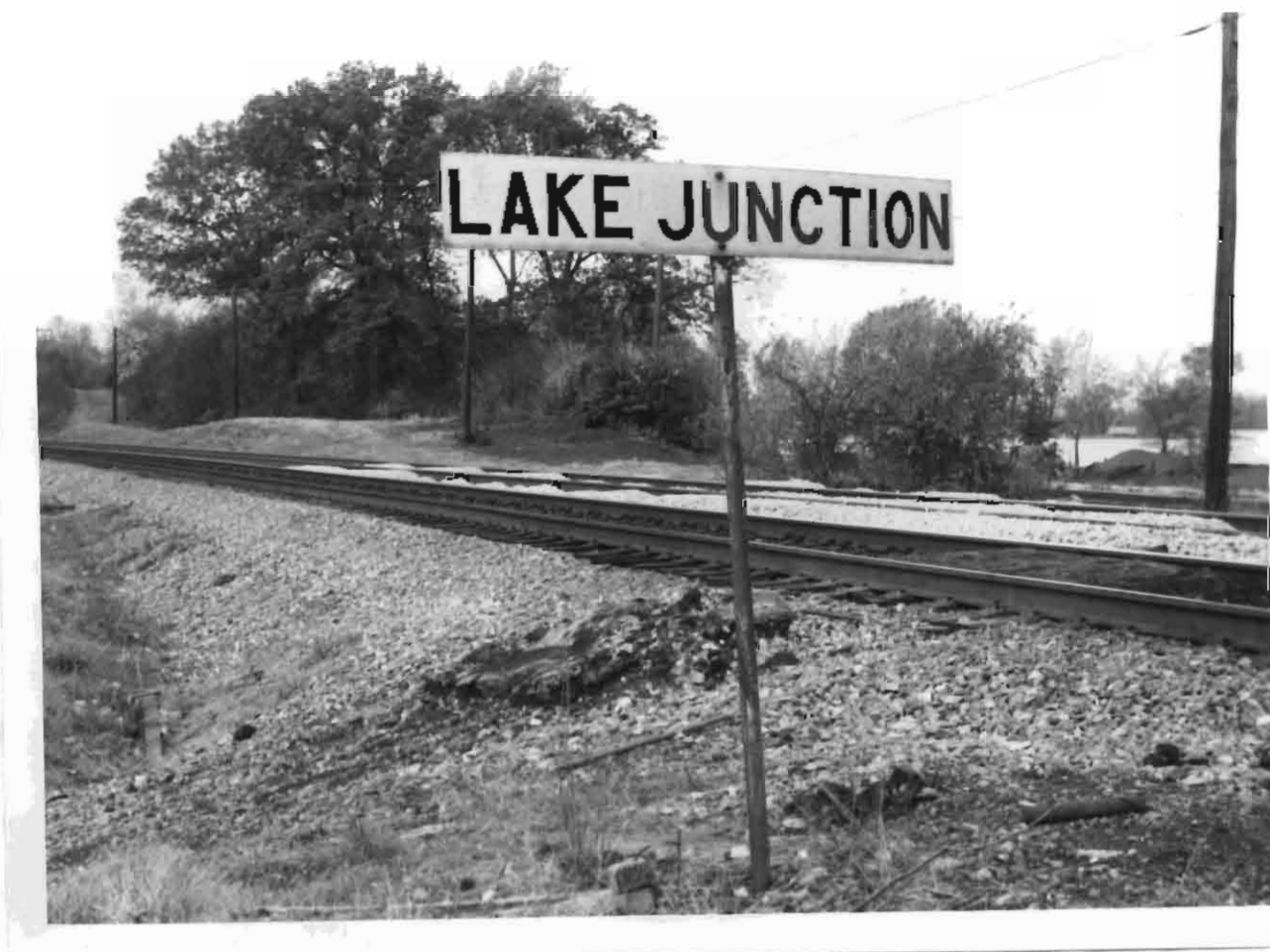
Site of Lake Junction Station at the end of Summit Avenue, today.

ticket on the train. 19 During the 1920's the station was busy enough to require a ticket agent, Charles W. Bonnell. 20 Whether busy or not, the station generated foot traffic on Summit Avenue.