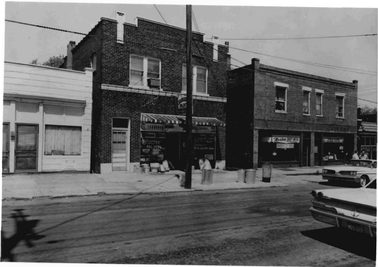
Old Van Hort Drug Store, 733 Marshall Avenue, Graubner Berger Hardware Store, 735 Marshall Avenue, built 1926 for Floyd Wood, and 737 and 739 Marshall Avenue, built 1893. Photograph taken 1962.

The Missouri Pacific removed the old Lake Junction Station in 1937, 52 but there was still much foot traffic in the area because the Manchester streetcar was an important commuter facility through World War II. 53 However, around 1950 the streetcars stopped running. 54 The bus company purchased the viaduct over Deer Creek and used it until it became unsafe and was torn down in the 1970's. 55 Automobiles, shopping centers and supermarkets took customers away from these convenient neighborhood stores. Zoning would not permit more stores or parking lots. 56