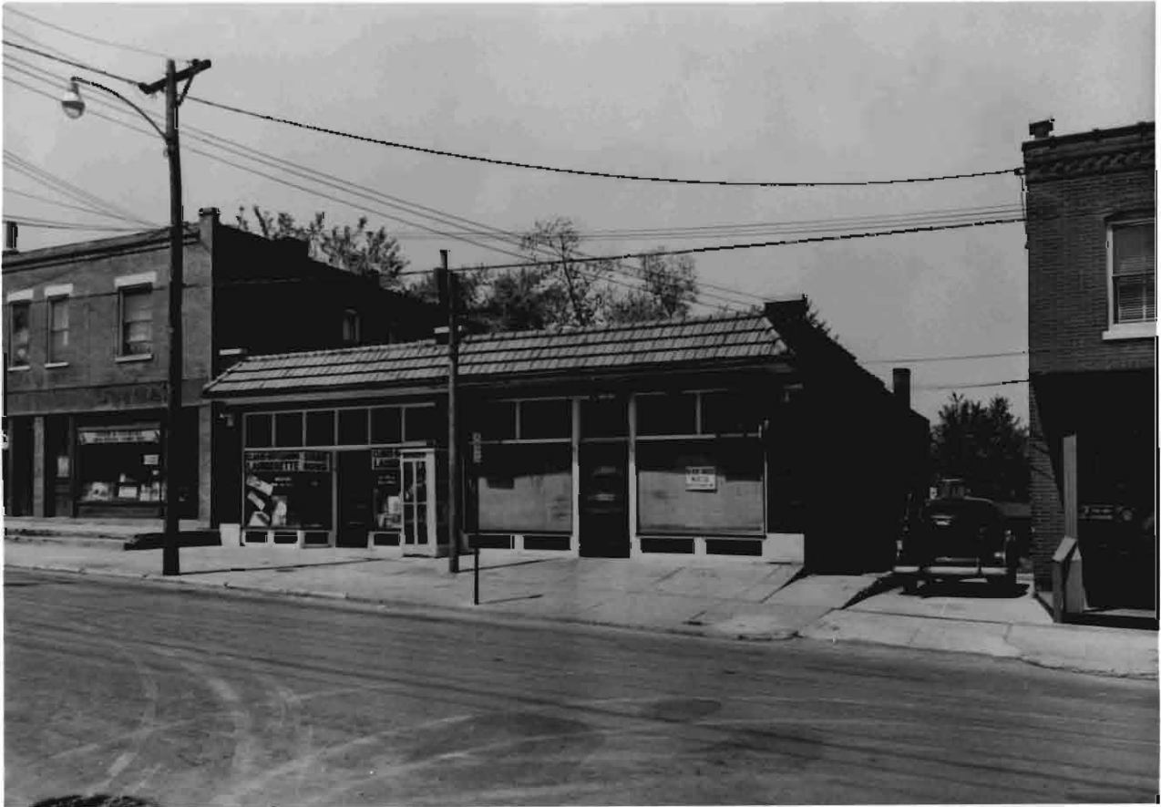
Goldstein's Piggley Wiggley Grocery Store, 741 and 743 Marshall Avenue, built 1927. Photograph taken 1962