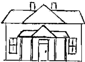
National Folk I-House

This survey identified 172 buildings from this period of history. Appendix B, Building Styles Within Thematic Periods of Development , provides a breakdown of the distribution according to the style and use within the various periods of development. The residential architectural resources from this period were prevalent--some 157. Four stylistic movements are represented--National Folk, the Romantic Revivals, Victorian and Eclectic. The National Folk houses fall into three significant types--the I-house, the gable-front-plus-side-wing plan and the one story square with a pyramidal roof.