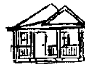
National Folk Square with Pyramidal Roof

Less seen are the rectangular boxes with front gables and the massed plan with side gables. Often the windows of these houses feature two vertical lights over two vertical lights in double-hung wood sash. As the gable-front-plus-side-wing plan's name suggests a front facing gable was compounded by the intersection of a gabled wing. Common features include porches at the L made by the intersection of the 2 wings, uniform roof ridges (rather than stepped), one room depth to each wing, balloon-frame construction and consistent (rather than varied) clapboard wall surfaces. Often the gables feature returns or pediments, referring to the Greek Revival. The scale of these homes vary greatly corresponding to the range of wealth. Representative examples of this type include: