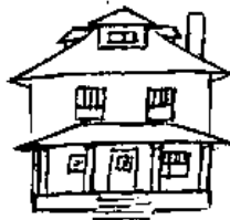
Eclectic American Four-Square

The American Four-Square, a common house type built after the turn of the century also offered comfort and simplicity. Most of the Four-Squares identified during this survey are of frame construction. However, Kirkwood also has brick Four-Squares. The Four-Squares were being built well into the 1920's. Like the Homestead houses they often feature Craftsman or Prairie details, as well as Classical and Tudor elements. They are two story rectangular boxes with medium to low hip roofs, often featuring dormers on at least three of the four sides of the hips. They have prominent full or partial width primary entry porches.