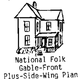
National Folk Gable-Front Plus-Side-Wing Plan