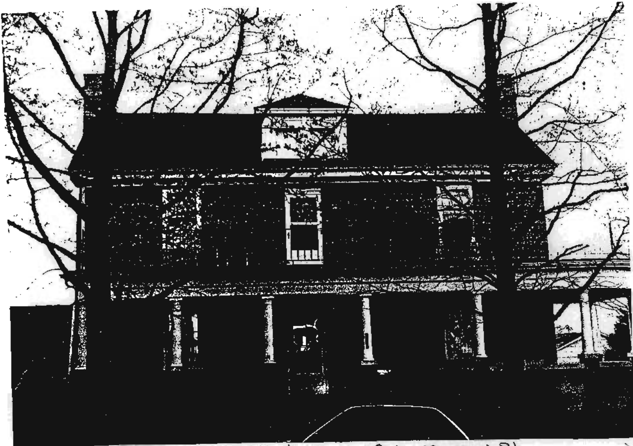
Rock House, 119 N. Missouri St.