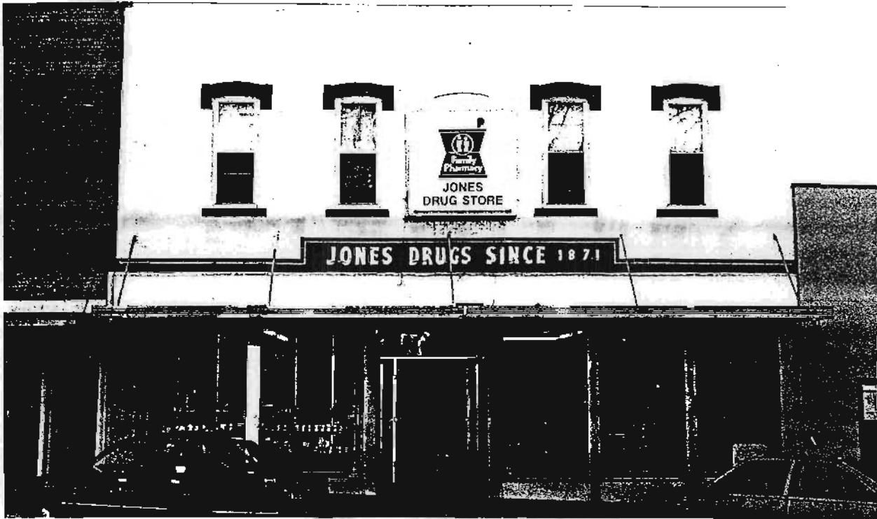
Jones Drug Store 125 Court Street 29