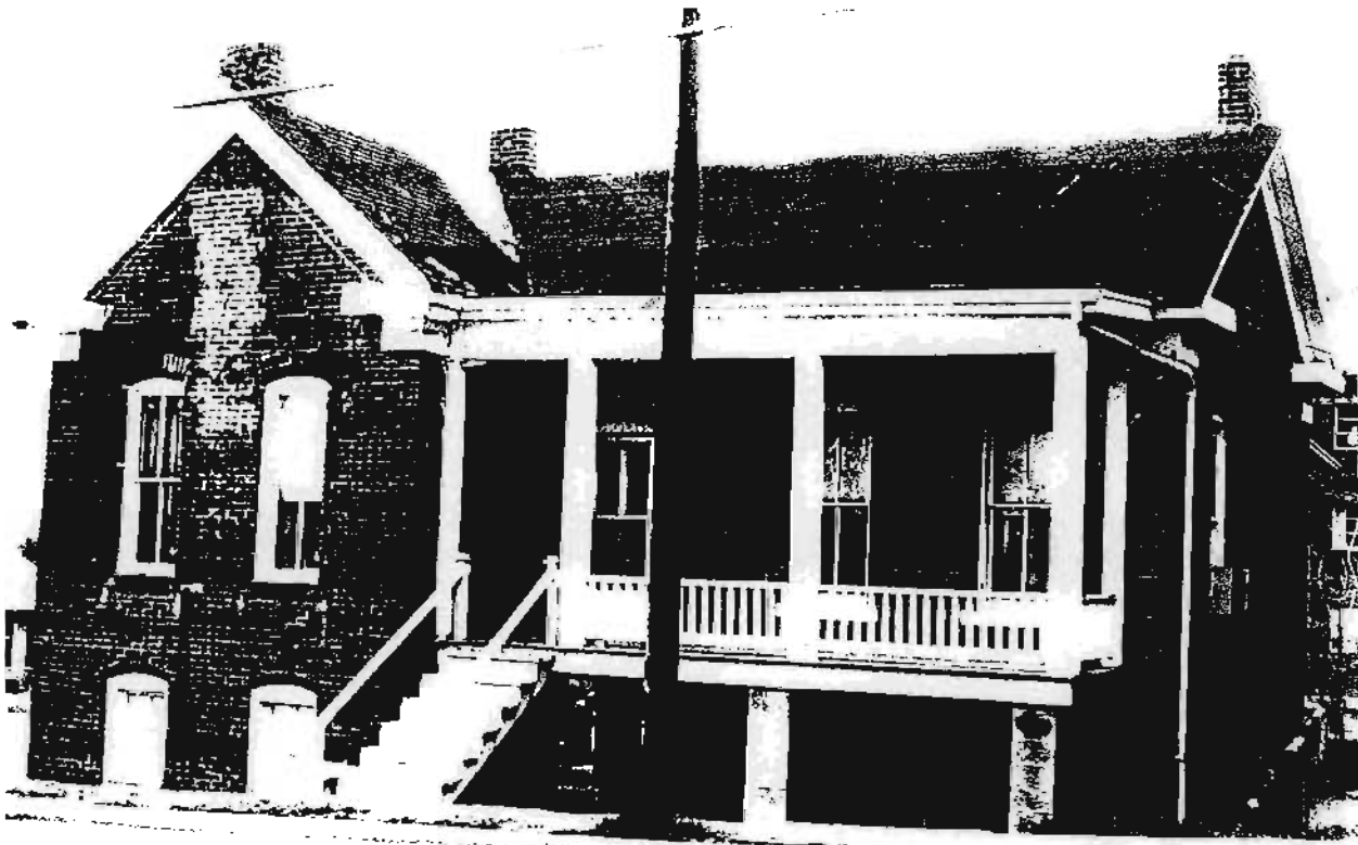
House, 111 E. Adams St. 15