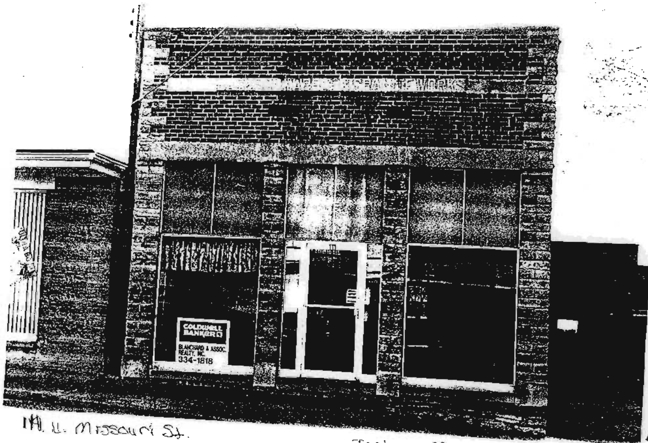
141 W. Missouri St.