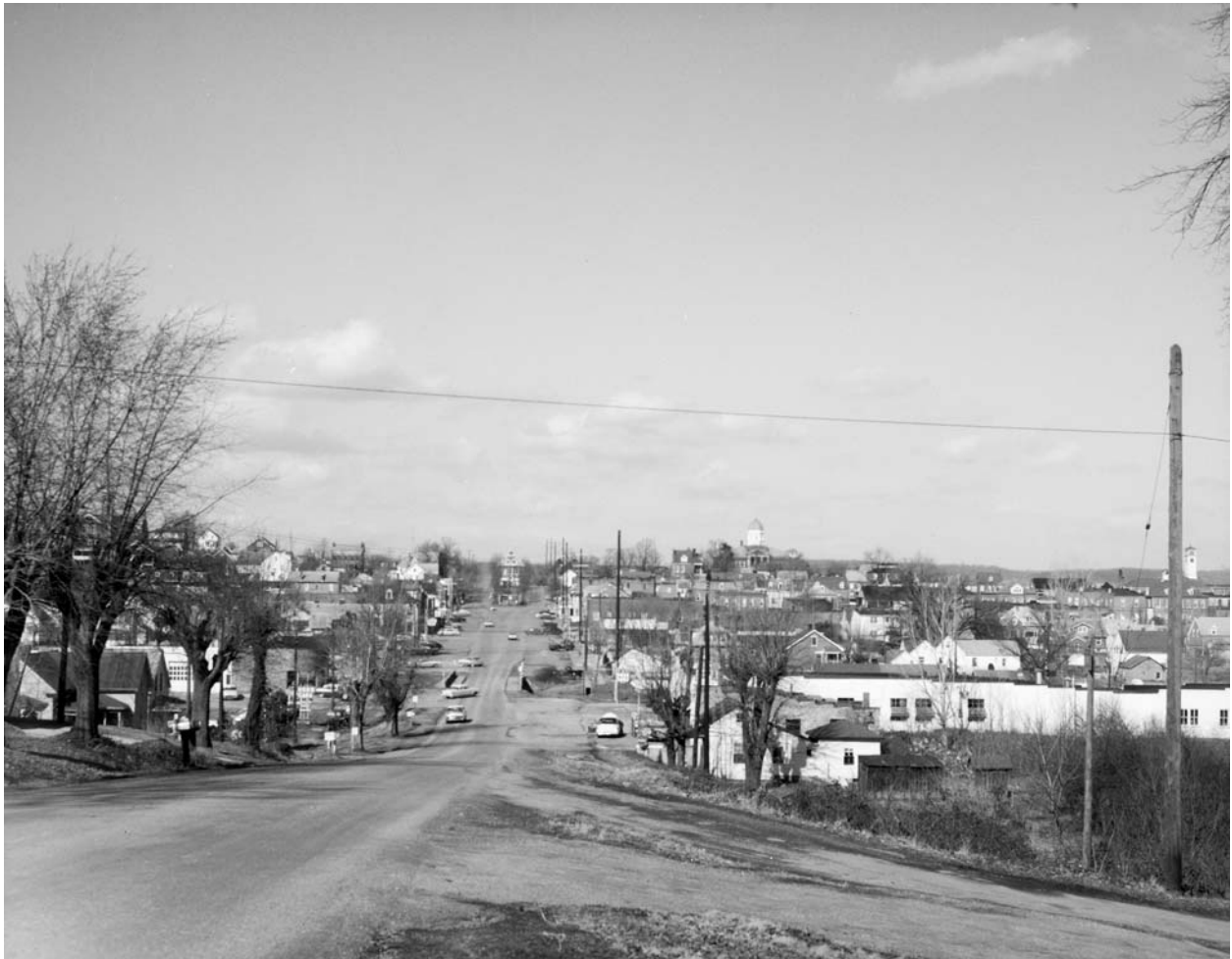
Figure 4: Market Street, looking south, c. 1950.

Hermann Historic District (Amendment) Gasconade County, Missouri