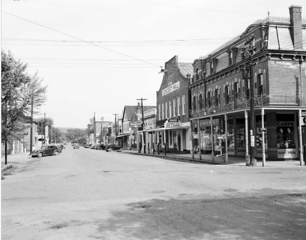
Figure 1: First Street, looking southeast from intersection with Schiller, c. 1940.

Hermann Historic District (Amendment) Gasconade County, Missouri