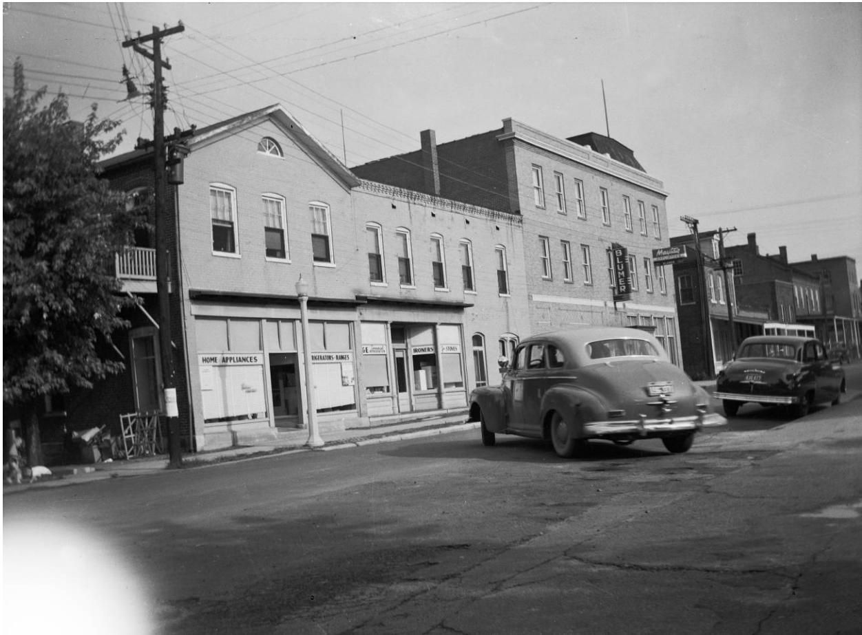
Figure 3: 200 Block Schiller Street, East side, c. 1940.

Hermann Historic District (Amendment) Gasconade County, Missouri