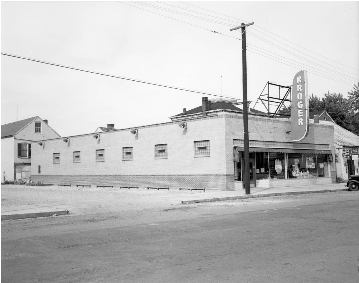
Figure 2: 225 E. First Street, c. 1945

Section number photo log/figures Page 105 Hermann Historic District (Amendment) Gasconade County, Missouri