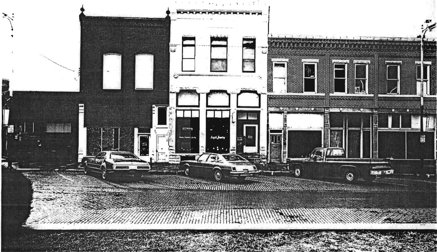
Figure 5a. South side of Square E. Wall Street