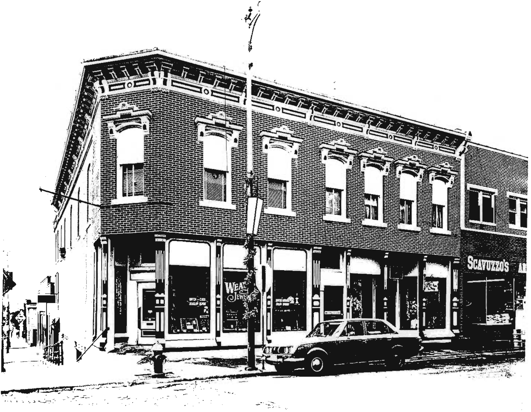
Figure 9. Southwest corner of Wall and Independence