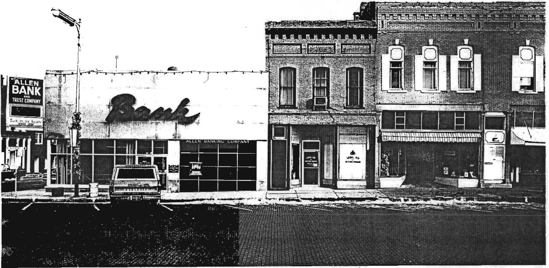
Figure 7a. North side of Square E. Pearl Street