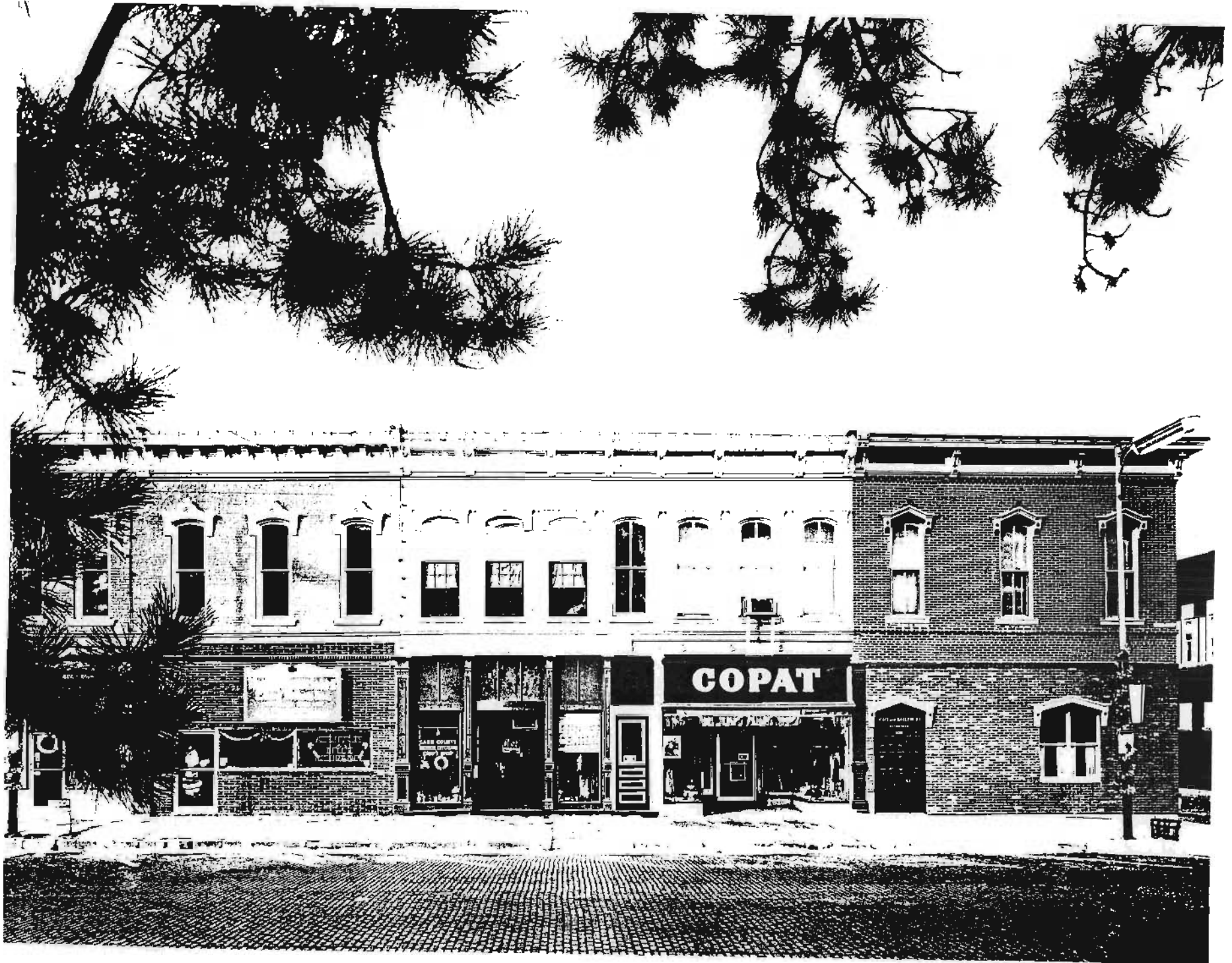
Figure 8b. West side of Square S. Independence