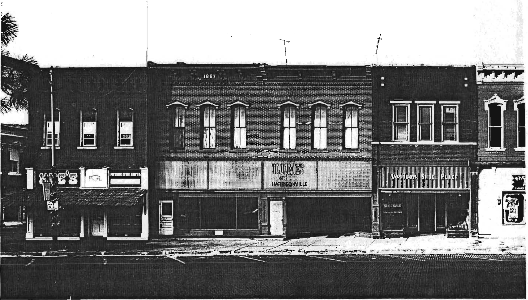
Figure 8a. West side of Square S. Independence