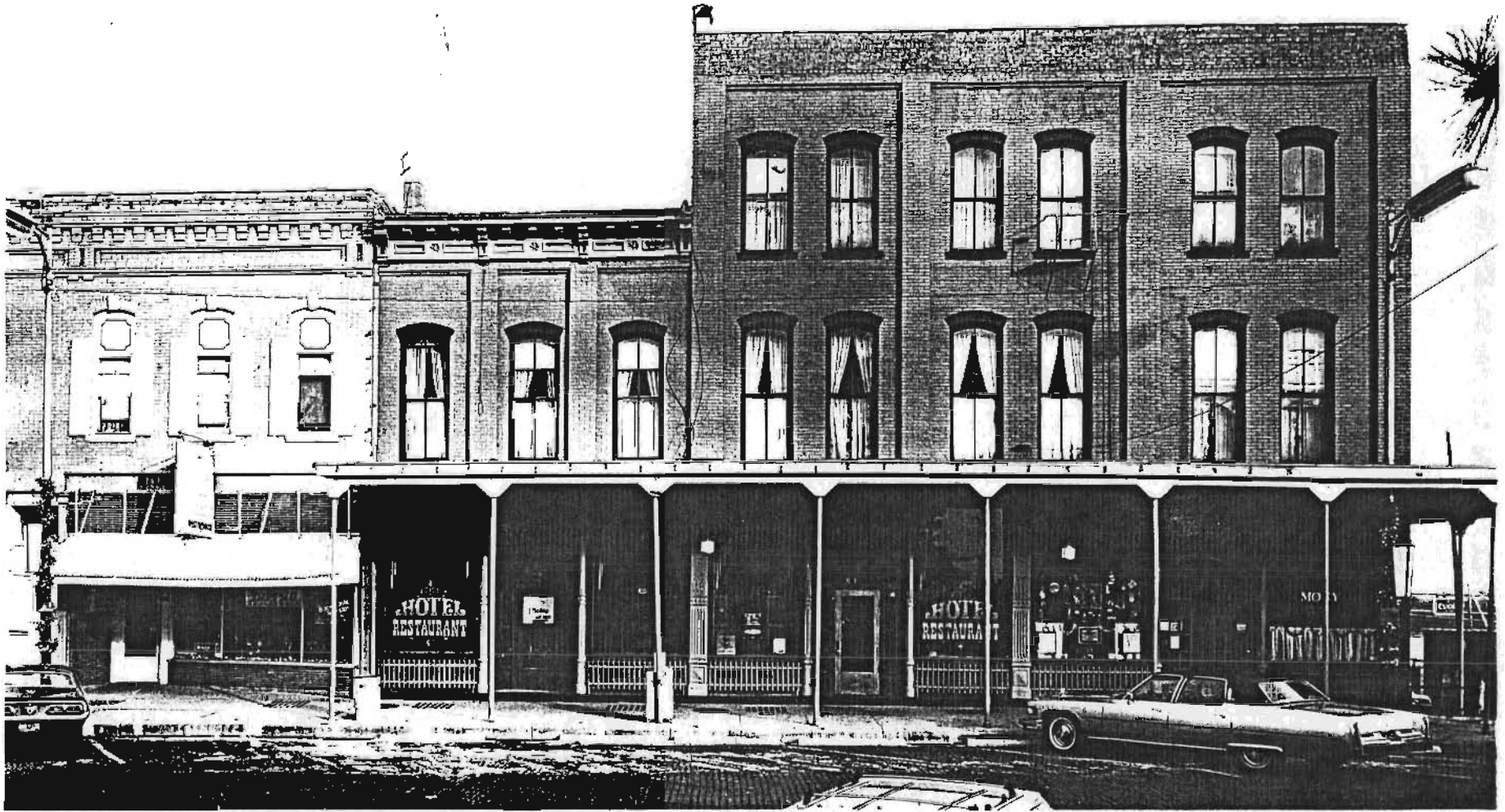
Figure 7b. North side of Square E. Pearl Street