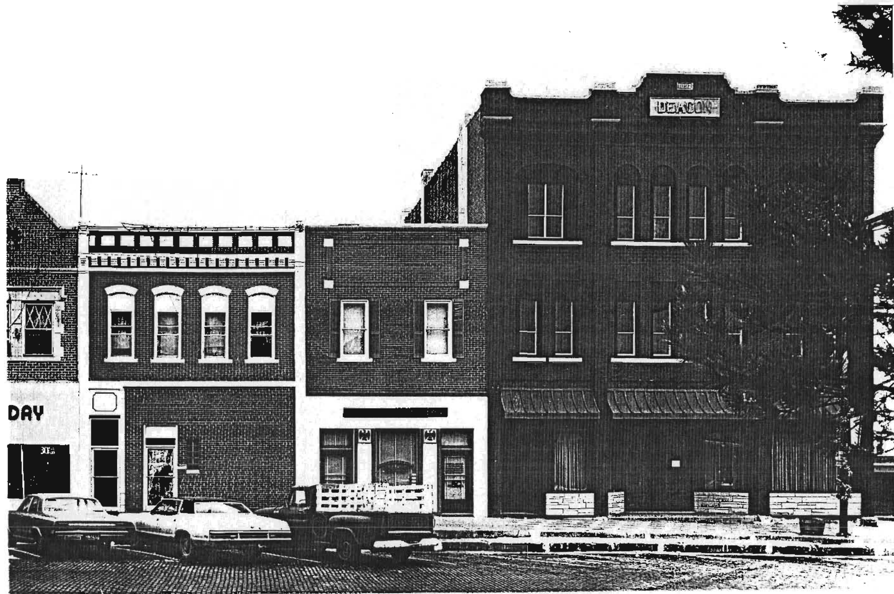
Figure 6b. East side of Square S. Lexington