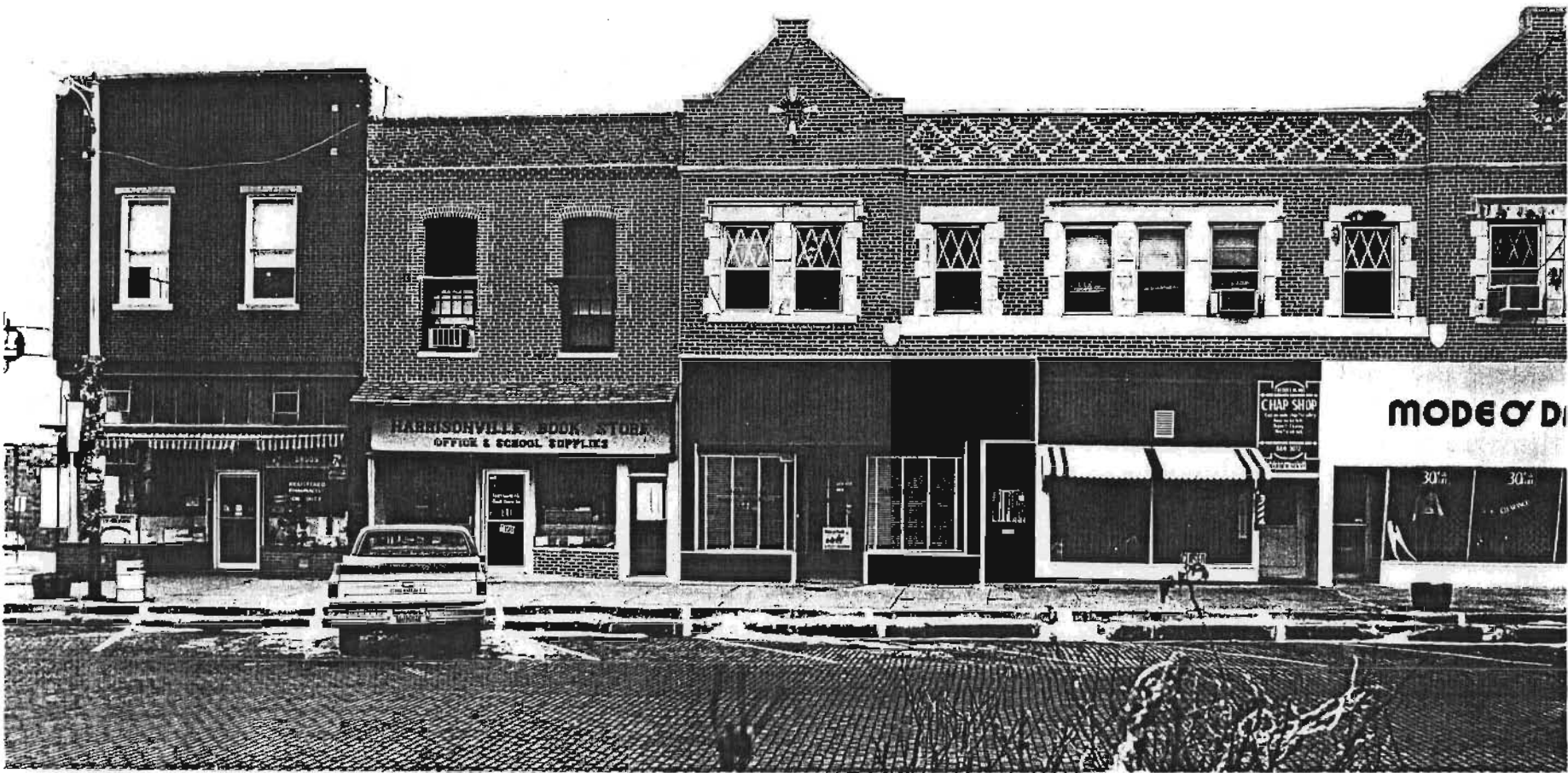
Figure 6a. East side of Square S. Lexington