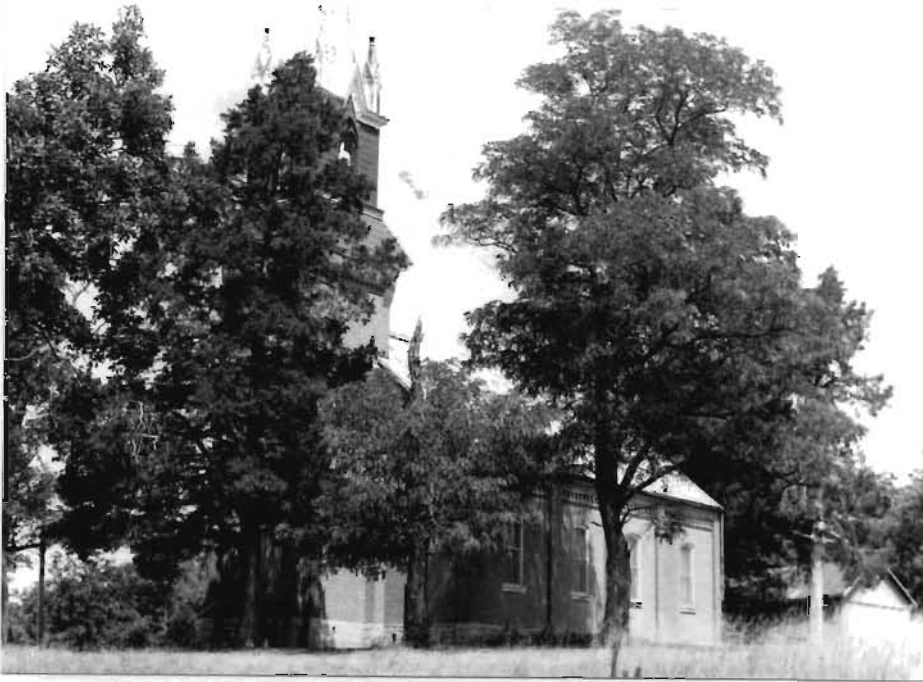
St. John's Evangelical and Reformed Church at Woollam

St. Johannes Evangelische Kirche was organized in 1858. The original church was a log building. The present church was built in 1879 and was constructed of locally kilned brick.