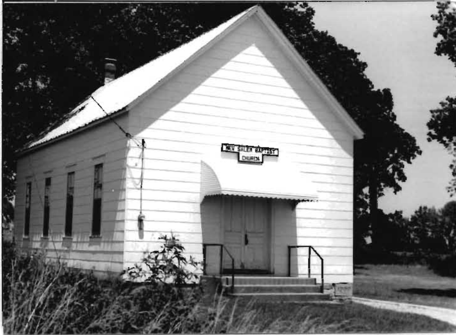
New Salem Baptist Church

The original building was erected in 1829, and was replaced by a log cabin in 1854. This church was the third one constructed. It was built in 1900 at a cost of $200.00