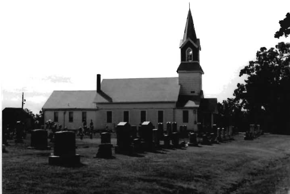
St. John's United Church of Christ at Bem

St. Johannes Evangelische Kirche was organized in 1858. The original church was a log building. The present church was built in 1879 and was constructed of locally kilned brick.