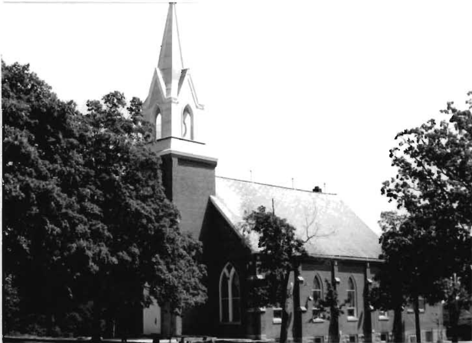
The St. James United Church of Christ at Charlotte

The original building was erected in 1829, and was replaced by a log cabin in 1854. This church was the third one constructed. It was built in 1900 at a cost of $200.00