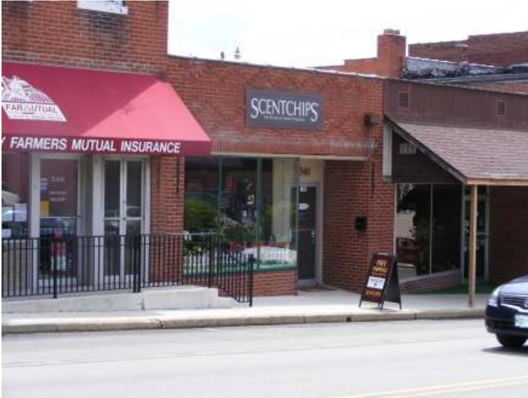
Figure 6. 340 Main Street (LN-AS-001-030) is an example of a one-part commercial block building.