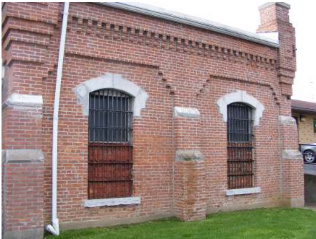
Figure 12. The former Lincoln County Jail (LN-AS-001-001) incorporates elements of the Gothic Revival style.

The Gothic Revival style replicates a variety of medieval Gothic architectural styles that date to the early nineteenth century. During the 1830s, American builders began to use the Gothic Revival style, primarily for classically designed buildings. Afterward, the style became prevalent in churches, colleges, and residential properties. 47 The Gothic style was most strongly tied to properties that could be associated with religious overtones - such as churches, hospitals, and schools. Fewer examples were constructed as governmental or public buildings for this reason. 48 Characteristics of the Gothic style include steeply pitched roofs with cross gables, gable dormers, symmetrical facades, pointed-arch windows, dominant lines, finials and towers. 49 Although the style's popularity faded after the turn of the twentieth-century, it was not uncommon in school and church designs during the early twentieth-century.