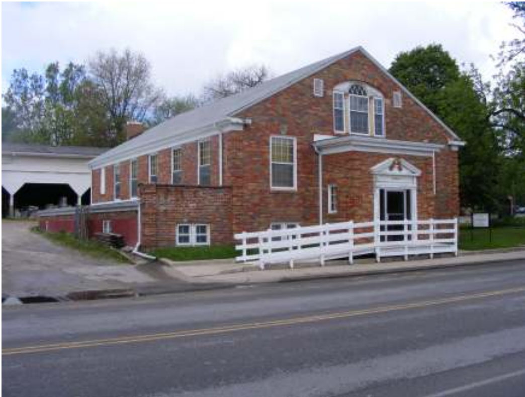
Figure 9. 166 Main Street (LN-AS-001-005) is an example of the Colonial Revival style.

The Colonial Revival style is an architectural and interior design movement dating to the 1870s, intended by promoters to reflect the country's colonial past. Since the style's origination during the late nineteenth century, Colonial Revival has become an important "national" style, utilizing the forms, design, and symbols characteristic of the country's early history. 41 While Colonial Revival influences are prevalent in furniture designs and decorative arts, the style itself is most fully articulated through architecture; most particularly in single-dwelling house forms. The Colonial Revival style was also popular in churches, public and government buildings, and commercial architecture. The style is prevalent in nearly every American city and town. 42 Over the years, Colonial Revival has developed into one of the most fashionable and lasting American styles. Typical features include gabled pediments and cornices with dentilled details, porches with columns, simple gambrel and hipped roofs with predominant side gables, and a central main entrance detailed with elaborate surrounds and fanlights. 43