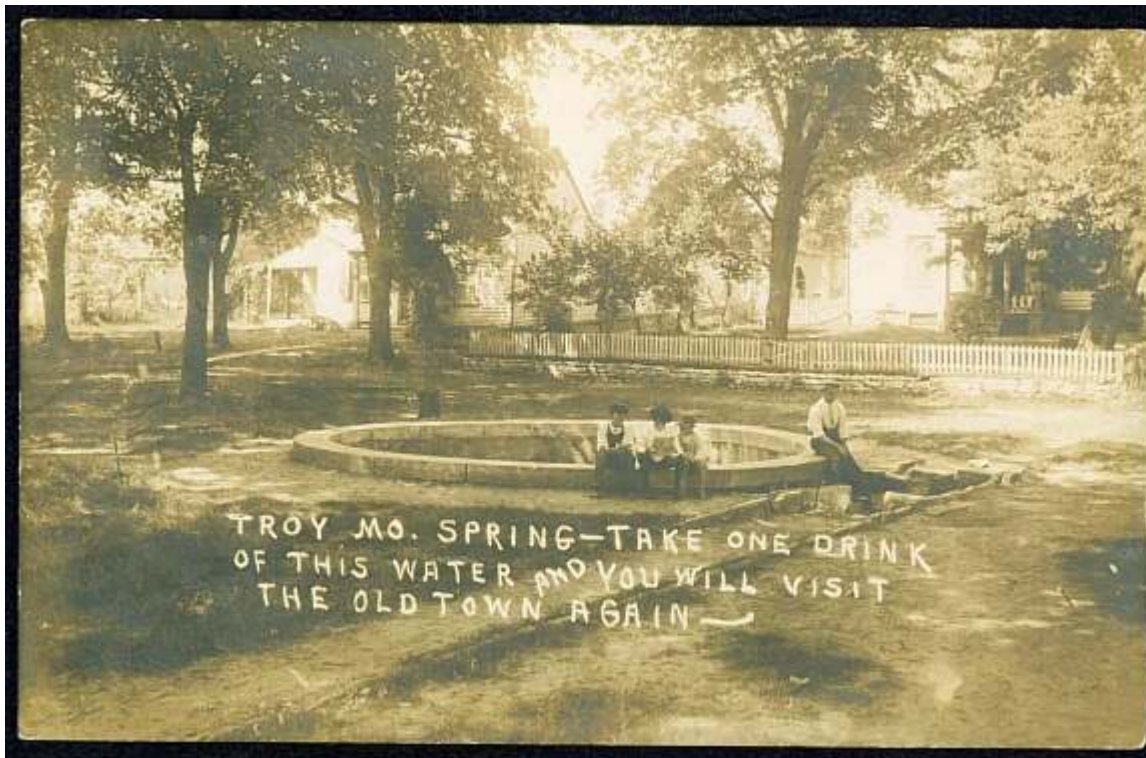
Figure 1. Troy Spring Park, site of Woods' Fort, c. 1910. Collection of Bonnie Pollard Johnson. Available online at: http://mogenweb.org/lincoln/album/ph-spring-troy.htm (Access date: 10 May 2010).

by Lieutenant Zachary Taylor, later elected as 12th President of the United States. 3 Although the fort was eventually dismantled and the spring is no longer present, its site is commemorated as the original Troy settlement (surveyed as LN-AS-001-006).