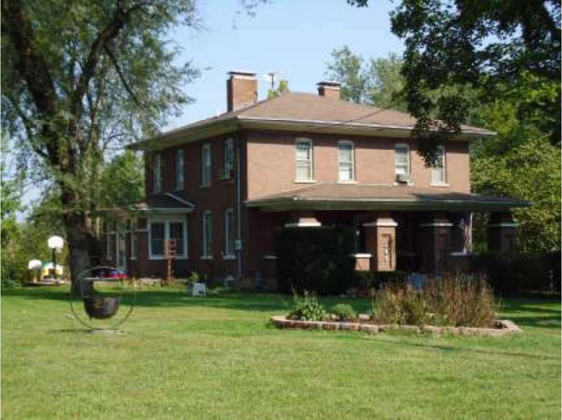
Figure 17. Weltmer House, 295 Lewis Street; view is northeast.