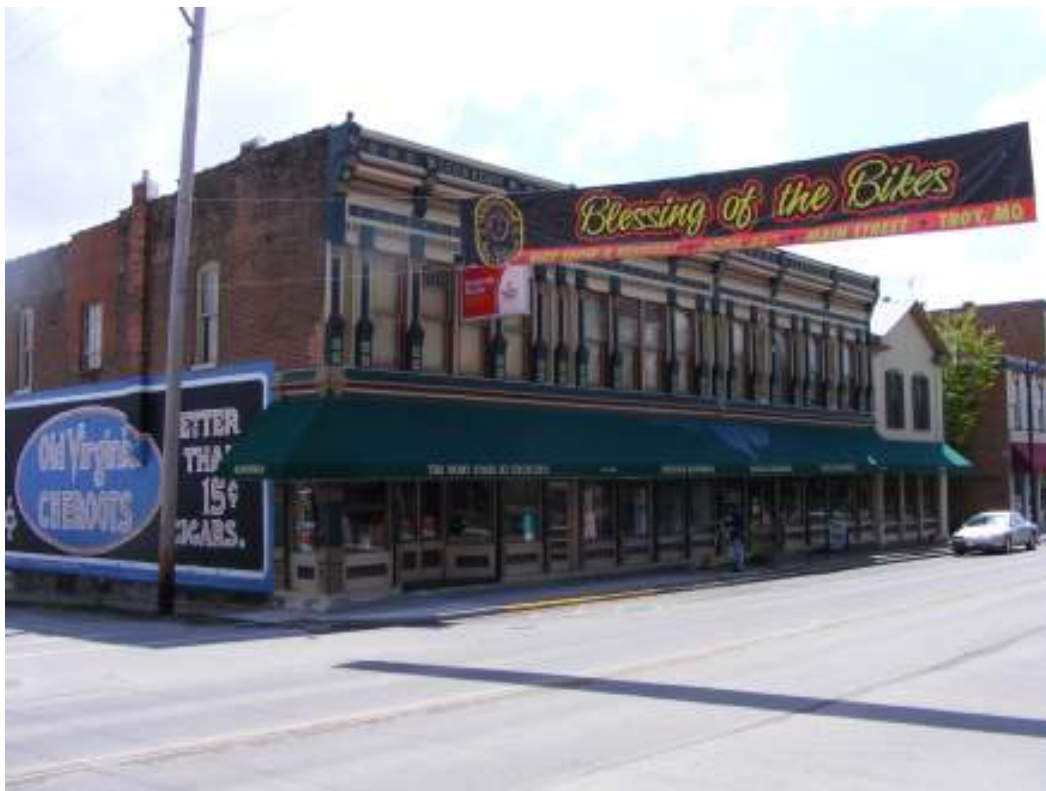
Figure 15. 530 Main Street (LN-AS-001-013) is an excellent example of the Italian Renaissance style

The Italian Renaissance/Renaissance Revival style became popular in America during the late nineteenth and early twentieth century. The style was part of the Beaux Arts School movement, and was copied from Renaissance Italian landmarks in Rome, Florence, and Venice. 54 The style reached its height of popularity during the early twentieth-century, with few examples built after 1940 (popularity declined during the 1930s). The style is different from the Italianate movement in that it more precisely copied true Italian architecture and was not a re-creation based on architectural renderings. After photographic documentation became accessible in architectural journals and related publications, builders were able to directly copy original buildings; whereas when the Italianate style was popular (late 1800s); builders relied on sketches that were open to interpretation. Italian Renaissance/Renaissance Revival style buildings are usually two-to-three stories in height and have a roofline balustrade or parapet that is heavily adorned and often rises above the roofline. Windows have heavy brackets and cornices; and arcaded entries and porches are common. 55