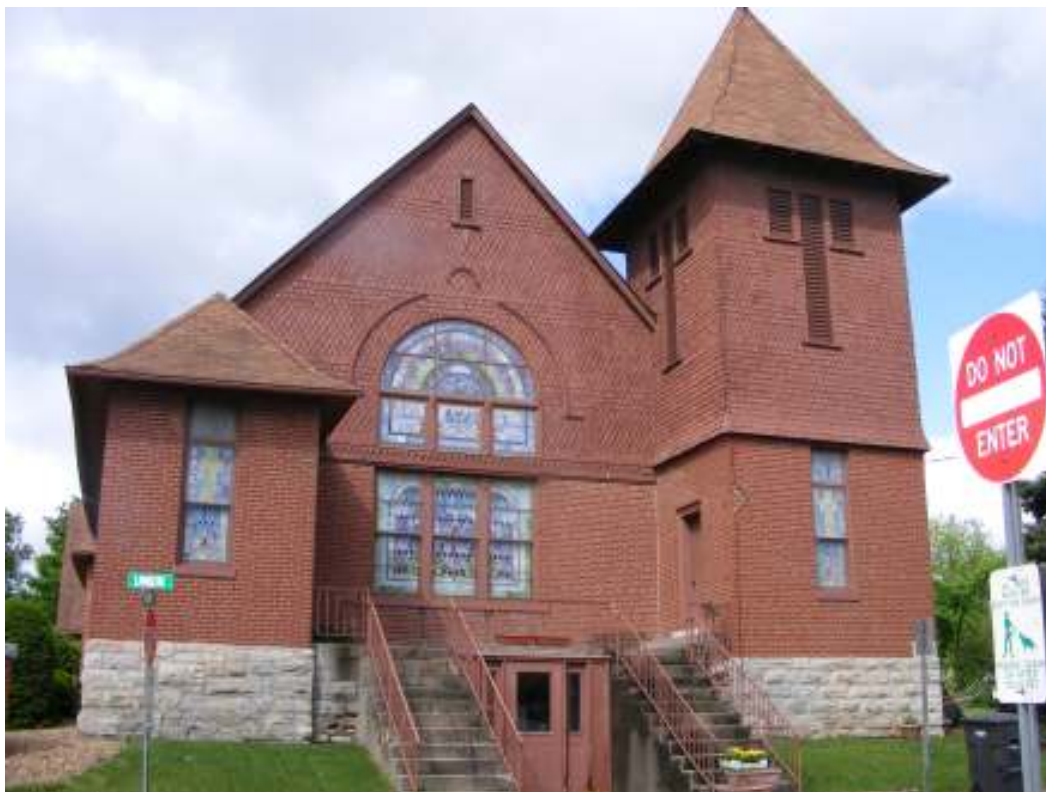
Figure 16. 211 Boone Street (LN-AS-001-007) is an example of a Shingle style church.

The Shingle style was most popular in the northeastern United States. The style originated in Boston during the 1880s and was an outgrowth of the Queen Anne architectural movement. Both styles share features such as eclectic and excessive exterior adornment - though in the Shingle style this is most elaborately illustrated by the massive exterior shingles that envelop exterior walls, roofs, and porches. Architect Henry Hobson Richardson is believed to have introduced the Shingle style and used it primarily in residential designs in rural and suburban areas. 56 Richardson also developed the Romanesque Revival style that was popular in public buildings and churches. 57 Troy's single example of the style in its downtown district is an excellent example of the Shingle style with Richardsonian Romanesque influences as evidenced by its massing, rusticated foundation, and widely arched primary window bay.