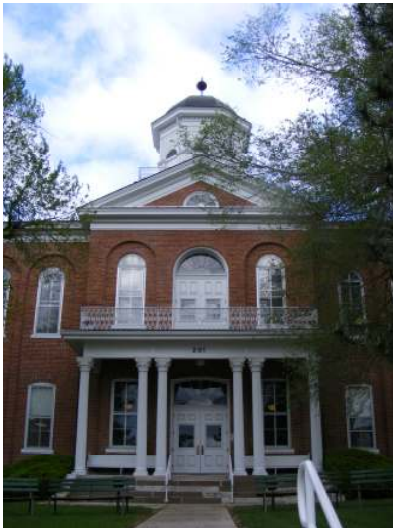
Figure 11. The Lincoln County Courthouse (LN-AS-001-002) in downtown Troy is an example of the Georgian style.

Georgian style architecture was a popular building style in colonial America and reflected building traditions that early settlers brought from Europe. It was common prior to the American Revolution and remained popular in residential design through the 1830s. In public buildings, the style continued to be utilized well into the twentieth century. The Georgian style dominated colonial architecture from 1700 to c. 1870; and it is most frequently found in the northeastern states. Later examples are common in the Midwest and South, particularly in relation to public building design, i.e., courthouses, universities, and libraries. Typical features of the style include cupolas, pedimented entries, paneled doors with decorative crowns and pilasters. 46