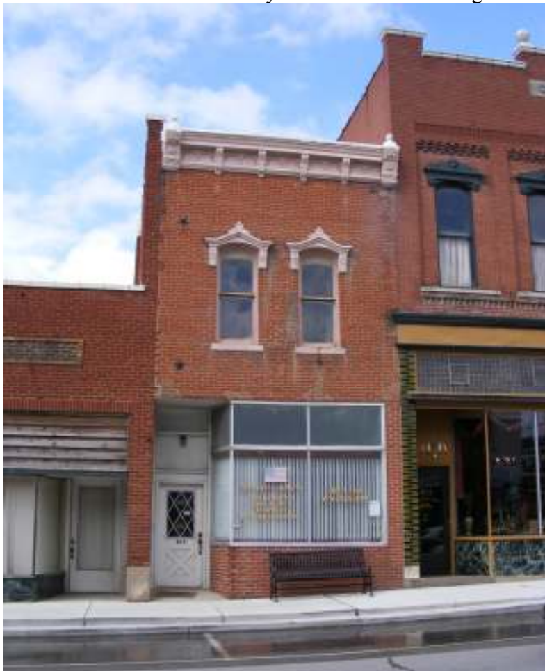
Figure 14. 421 Main Street (LN-AS-001-018) is an example of an Italianate commercial style building.

The Italianate style was popular in residential and commercial properties constructed c. 1870 – c. 1890. The style is identified by its decorative window and roofline details; usually in the form of an architrave, frieze, and cornice; and paired brackets near the roof overhang. Building corners (particularly in commercial examples) often have brick or stone quoins. 51 The Italianate style became popular in residential architecture during the 1850s through architectural publications, such as those authored by Andrew Jackson Downing. The style's frequent use in commercial buildings was spurred by the incorporation of cast iron storefronts that replaced heavy brick and stone, allowing thin display windows to be easily incorporated on lower level storefronts. 52 The style (in America) was a reaction to the nation's western expansion movement. It quickly became popular in both rural and urban settings once machine-produced materials could be inexpensively duplicated and shipped via railroad. Ornamentation is most visible at rooflines, cornices, above windows and doors, and on porches. In relation to commercial properties, embellishments are also seen in the coursework dividing floors, particularly above storefront windows. Both brick and iron storefronts are common in Italianate style commercial buildings. 53