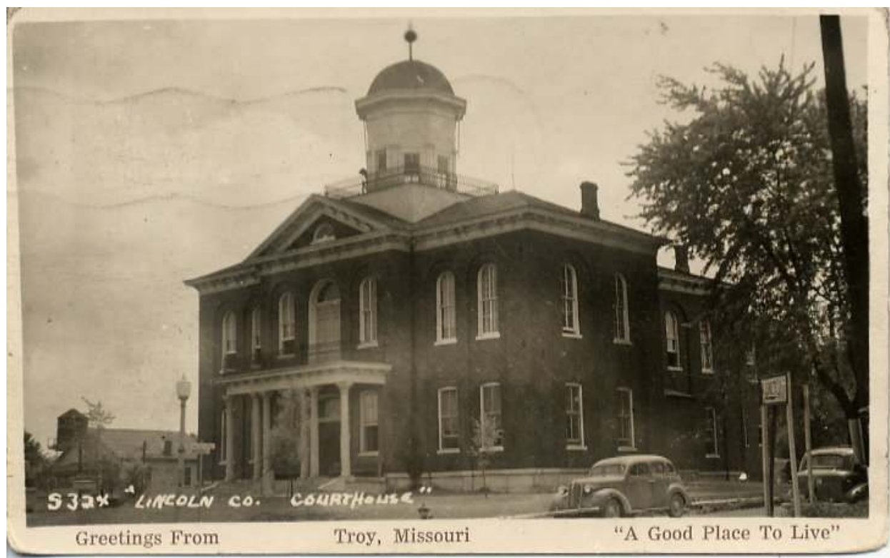
Figure 2. Lincoln County Courthouse, c. 1930. View is southwest. Available online at: http://mogenweb.org/lincoln/album/ph-spring-troy.htm (Access date: 10 May 2010).

Farmers' and Mechanics' Bank, and at least three brick mercantile establishments that were two-to-three stories in height. The local tannery constructed in the 1840s served as the town's largest manufacturer, producing boots, shoes, saddles, and harnesses. Among Troy's local shop owners were druggists, dressmakers, milliners, blacksmiths, and jewelers. 21