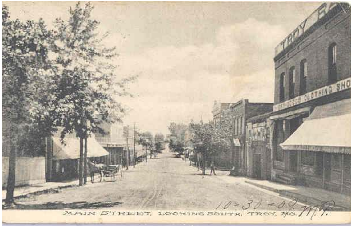
Figure 4. Main Street; view is south, c. 1909.