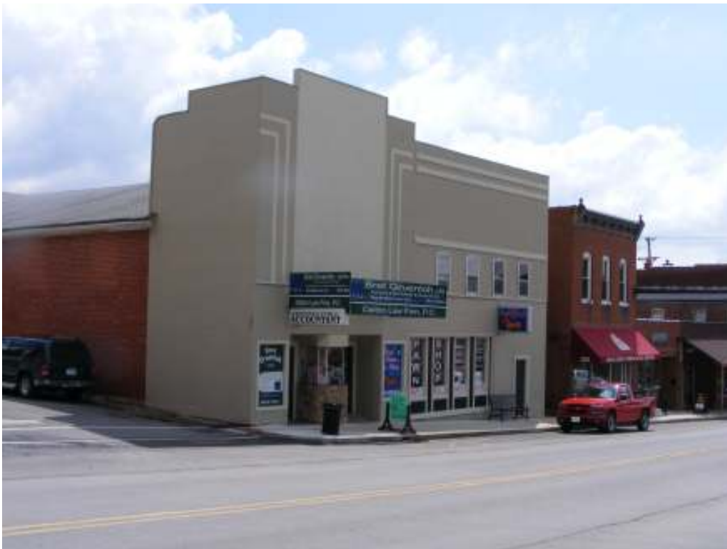
Figure 8. 300 Main Street (LN-AS-001-034) is an example of the Art Deco style.

The Art Deco and Moderne movement became popular in America during the 1920s following the 1925 Parisian Exposition Internationale des Arts Decoratifs and Industriels Modernes. Deco and Moderne styles showcased industrial influences in an artistic fashion. The movement was fully expressed through art, architecture, furniture, jewelry, and other fields of design such as clothing, glassware, and pottery. In architecture, these styles are frequently illustrated in theaters, apartment buildings, auto dealerships, and service stations. Elements of the styles are generally illustrated by smooth stucco and concrete clad exteriors, geometric design details (such as chevron and zigzag patterns), and artistic influences in the form of pastel colors and decorative motifs. 39 The two styles may be separately identified, though frequently the styles are integrated. Distinctions between Deco and Moderne are based on the shape of the building, as well as embellishments. Art Deco style buildings are normally rigid in form and highly decorative – often incorporating flowers and the female form. Art Moderne style buildings generally have rounded corners and display restrained forms of embellishments. 40