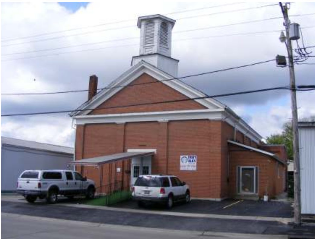
Figure 13. Troy's Elk Lodge (LN-AS-001-014) at 541 Second Street was designed as a Greek Revival style church.

Greek Revival was the most popular style in America during the first half of the nineteenth century. Its dominance was spurred by its associations with Greek political culture that - like the United States - supported a democracy. After the Civil War, the style's popularity was less prominent, but it continued to be used frequently in residential and public buildings throughout the remainder of the century. Greek Revival was often referred to as the "National Style" during its building peak (c. 1830 - c. 1850) and may be found in every state settled prior to 1860, including Missouri. The style is identified by its temple-style classicism, prominent columns (particularly surrounding porches and entries), multi-light transoms and sidelights, front and side gable returns and cornices, and multi-light window designs. 50