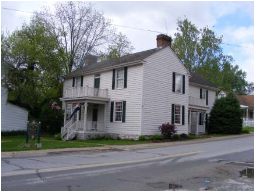
Figure 10. 210 Boone Street (LN-AS-001-008) is an example of a Federal style influenced dwelling.

The Federal style (also referred to as Adam or Adamesque) grew out of early colonial architecture that dominated the nation's public and private buildings from c. 1780 - 1850. The style was most prominent in Eastern Seaboard cities and based heavily on the designs of Charles Bullfinch (Boston) and Henry Latrobe (Philadelphia and Virginia). 44 Advocates were interested in an architectural style that appeared “philosophically appropriate for the nation” and that did not imitate earlier Georgian influences, which remained popular after the American Revolution. 45 Examples of the Federal style are found nationwide, particularly in vernacular adaptations such as that illustrated by the Britton House. Vernacular examples were constructed long after the style’s era of popularity had passed. Common features of the style include two-story primary elevation porticos, double-hung multi-pane windows, symmetrical placement of windows and doors, and minimal exterior adornments other than primary entrances, which usually featured transoms, sidelights, and/or fanlights.