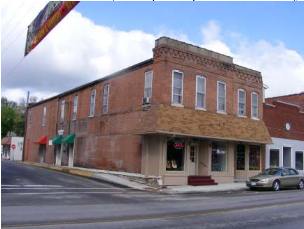
Figure 7. 499 Main Street (LN-AS-001-012) is an example of a two-part commercial block building.