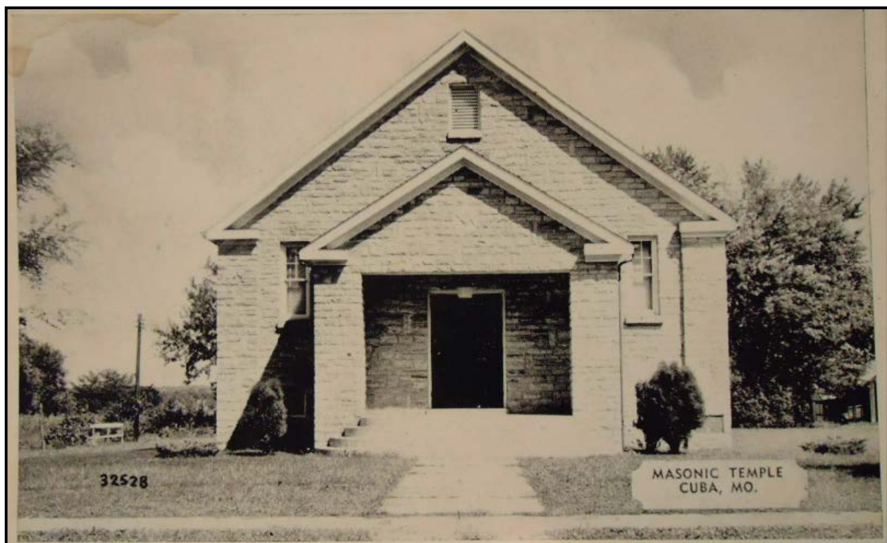
Figure 3: Early postcard, circa 1945.

in 1940 and that it continues to serve in that capacity today. In September of 2006 there were 124 members; other local lodges including the Order of the Eastern Star Charter Number 398 have met in the building at the courtesy of the A. F. & A. M. 10 The Cuba Lodge's importance to the local masonic order and to the community is unmatched in any other secular institutional buildings within Cuba as it is the first and the only fraternal building constructed in the city for the sole purpose of the use as a Masonic lodge. The building retains excellent integrity and its purpose is clearly recognizable today. Begun and completed in 1940, the building appears today unchanged on the exterior (Figure 3).