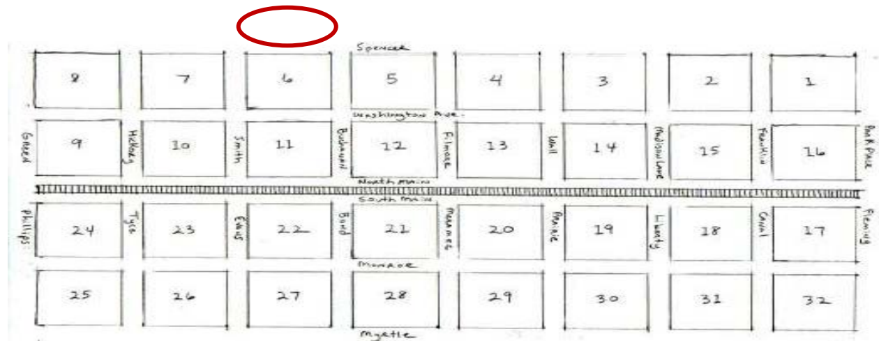
Figure 2: Original City Plat with 1940 Lodge site circled.