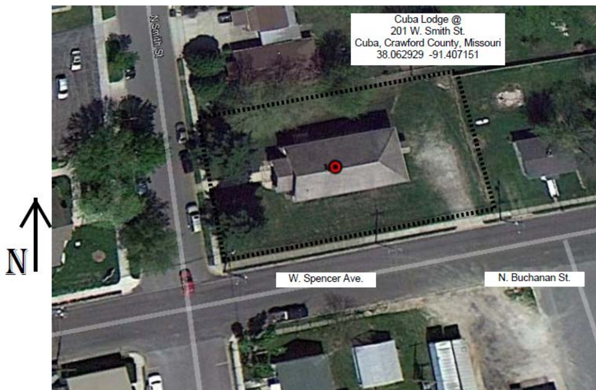
1" : 64'