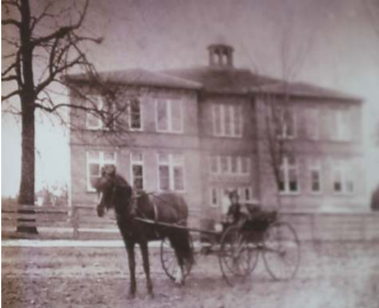
Fig. 1: Image of the 1905 school that until c. 1960 stood in front of the Annex.

Name of multiple listing (if applicable)