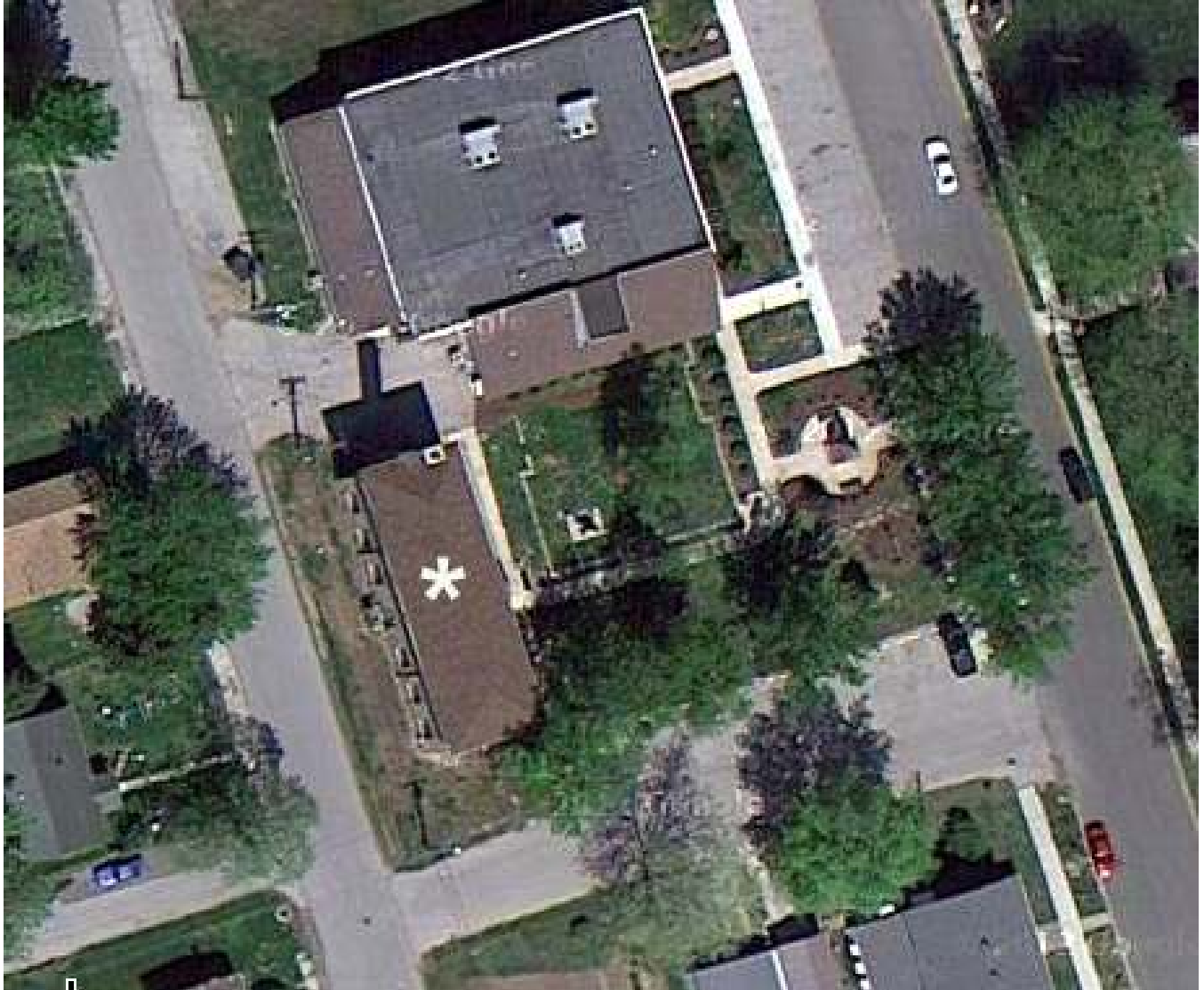
Fig. 2: Aerial view of the nominated property (indicated by the superimposed asterisk) shows the outline of the foundation of the 1905 school to the right.

Name of multiple listing (if applicable)