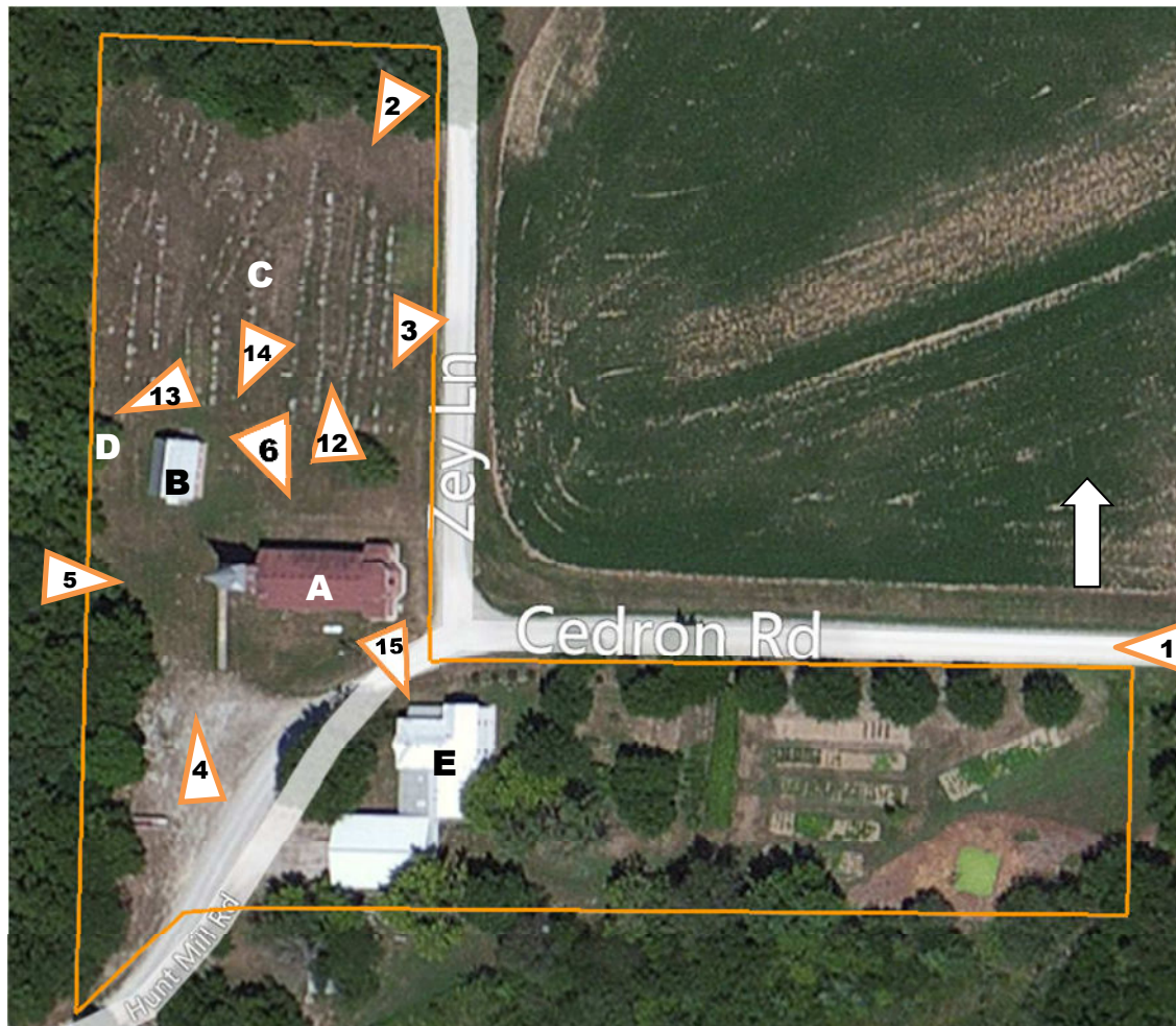
Figure 3: Site Plan and Exterior Photo Angles, Assumption of the Blessed Virgin Mary Parish Historic District

Assumption of the Blessed Virgin Mary Parish Historic District Name of Property Moniteau County, Missouri County and State Rural Church Architecture in Missouri, c. 1819 to c. 1945 Name of multiple listing (if applicable)