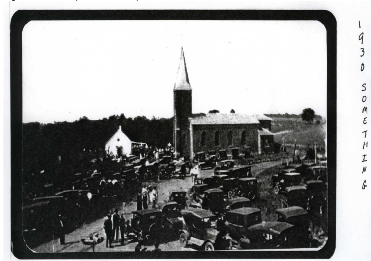
Figure 7: Historic photo of Assumption Church and School, c. 1930

Assumption of the Blessed Virgin Mary Parish Historic District Name of Property Moniteau County, Missouri County and State Rural Church Architecture in Missouri, c. 1819 to c. 1945 Name of multiple listing (if applicable)