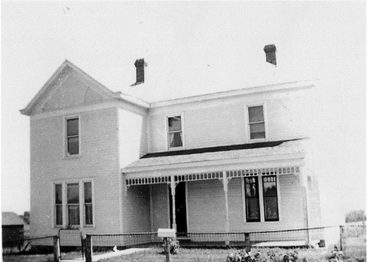
Figure 9: Historic Photo of Rectory, c. 1940

Assumption of the Blessed Virgin Mary Parish Historic District Name of Property Moniteau County, Missouri County and State Rural Church Architecture in Missouri, c. 1819 to c. 1945 Name of multiple listing (if applicable)