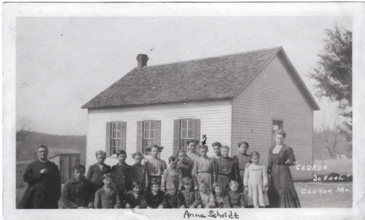
1911 School House Cedron, Mo.