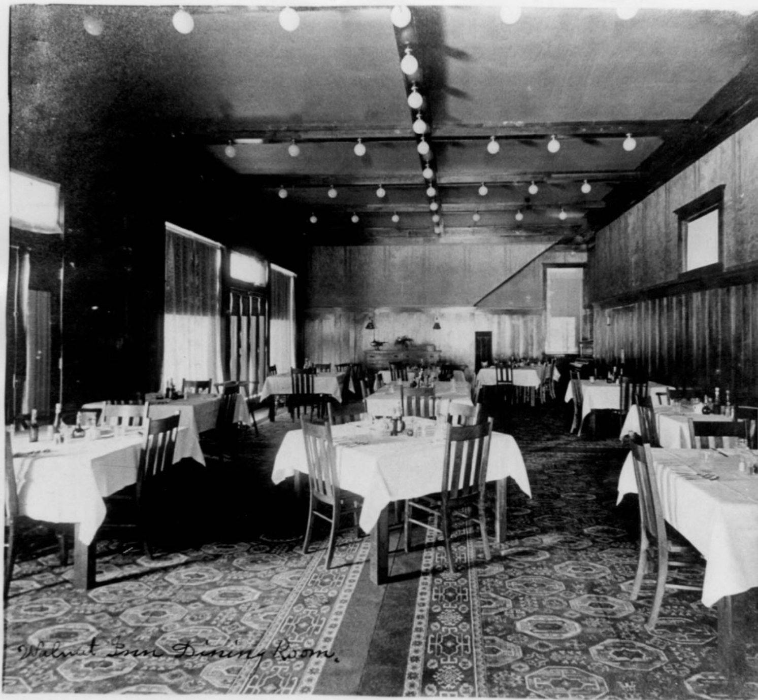
Walnut Inn Dining Room.