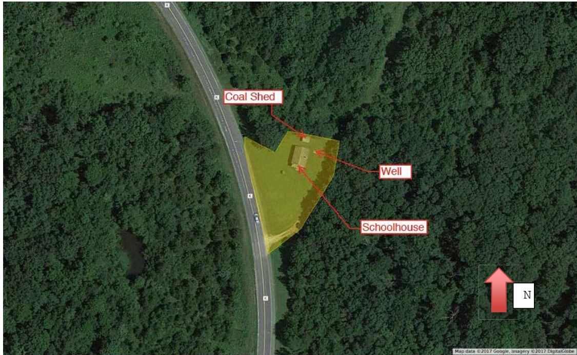
Figure 2: Site Map Lat: 40.146549 Long: -92.697284

Salisbury School site setting with boundary in yellow (shaded) and contributing structures.