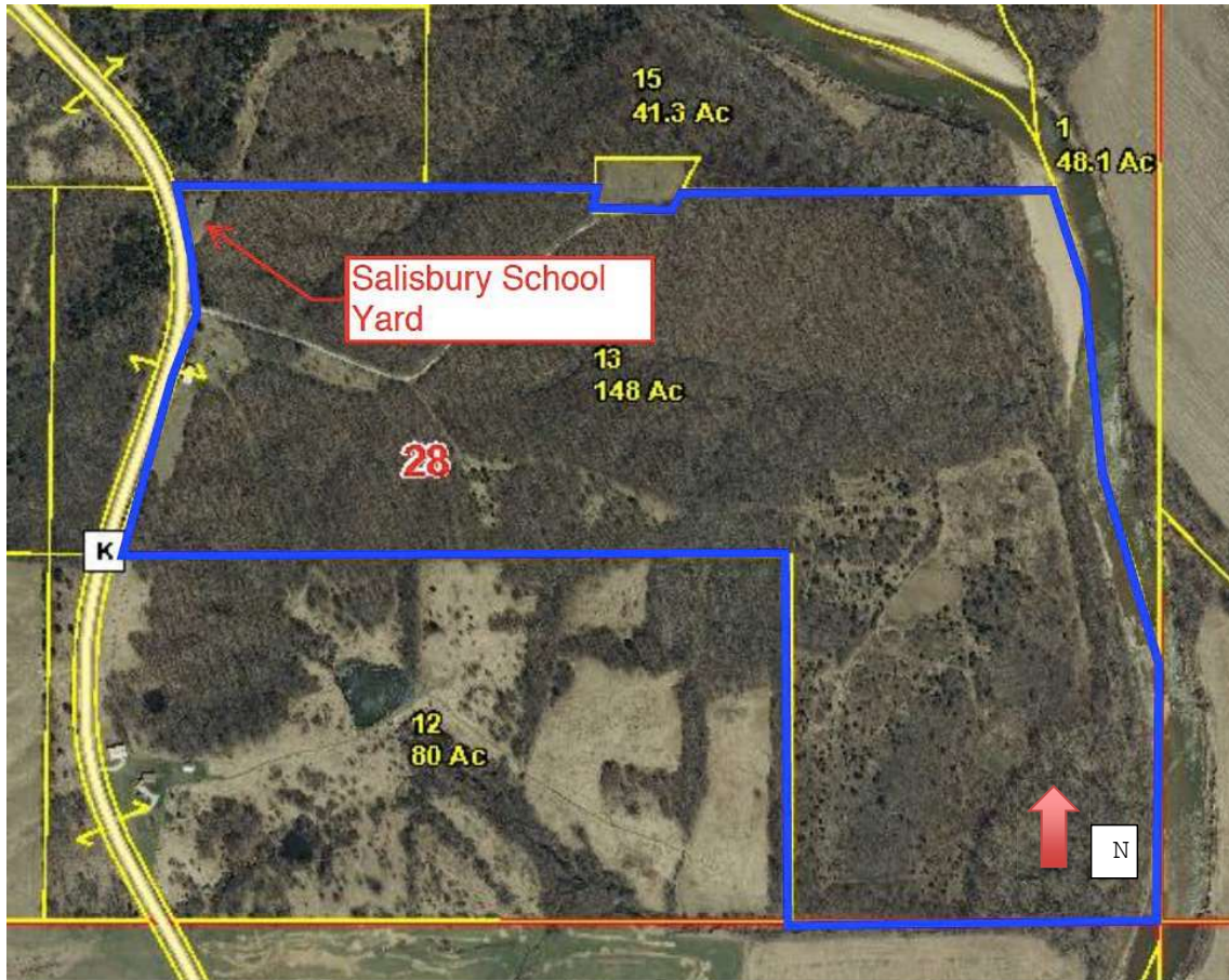
Figure 1: Contextual Map Lat: 40.146549 Long: -92.697284

View of legal parcel boundaries outlined in blue (identified as section 28) with Salisbury School yard in northwest corner.