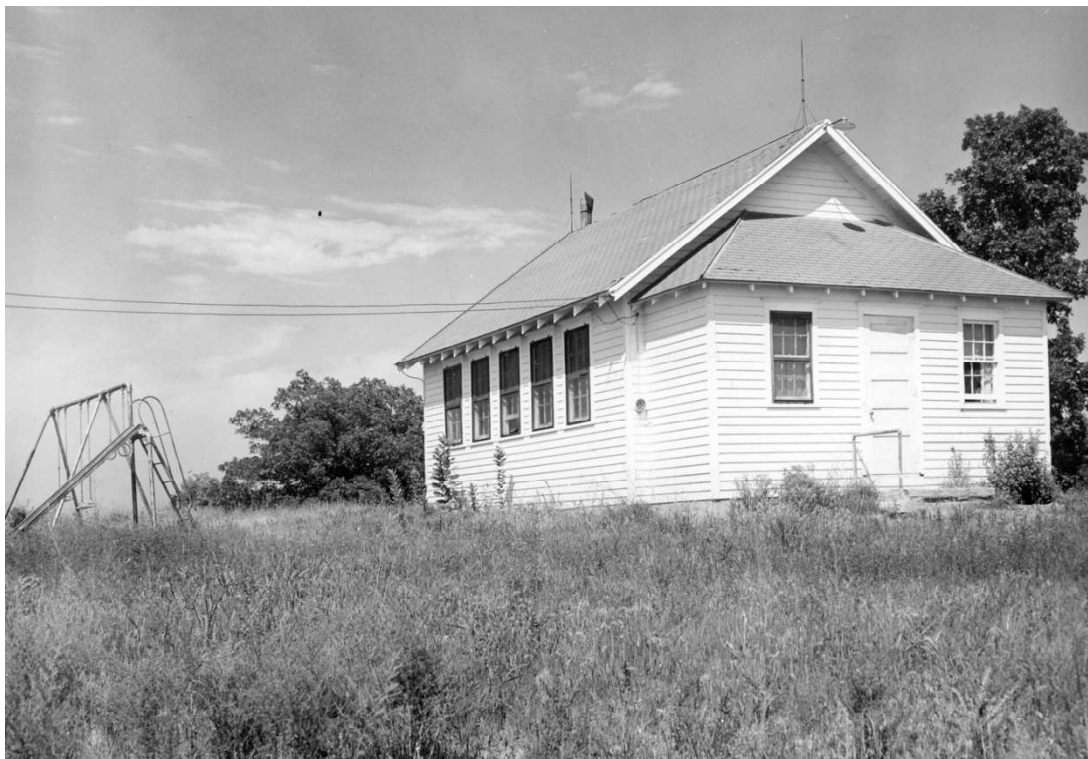
Figure 4: Salisbury School, ca. 1950s

Name of multiple listing (if applicable)