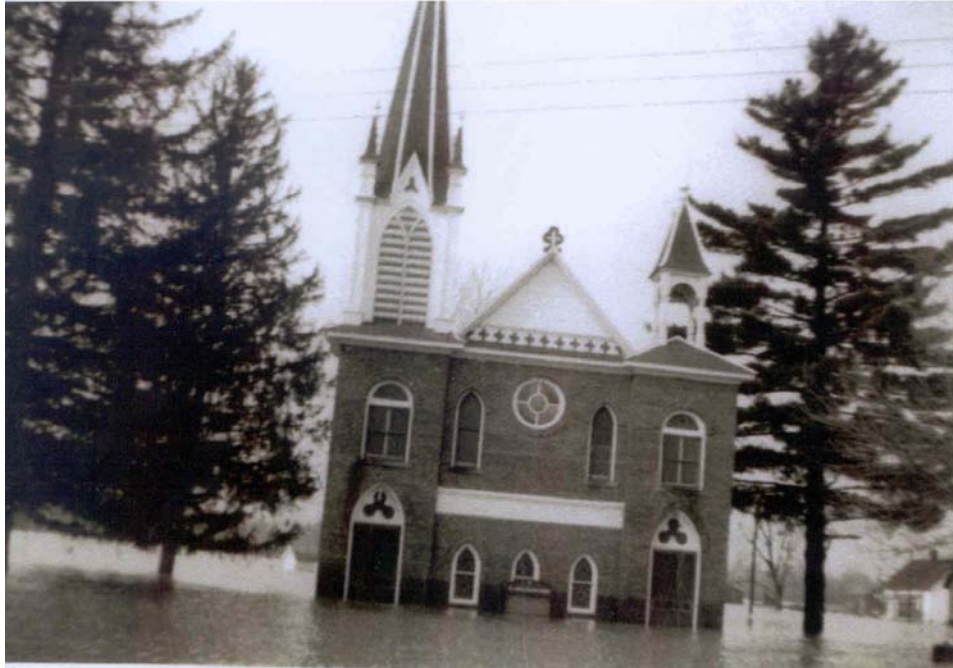
Figure 3: Historic photograph taken in April, 1952 during the Flood of 1952

Section number 8 Page 15 St. John's Evangelical Lutheran Church and Parochial School Holt County, MO