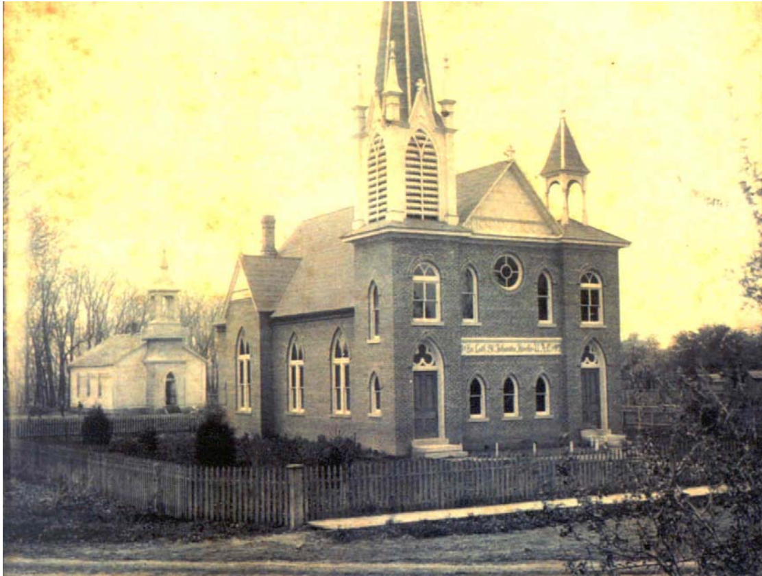
Figure 1: Historic photograph (taken around 1894), shortly after St. John's Evangelical Lutheran Church was constructed, showing the relocated "Church in the Timber" behind it.

Section number 8 Page 11 St. John's Evangelical Lutheran Church and Parochial School Holt County, MO