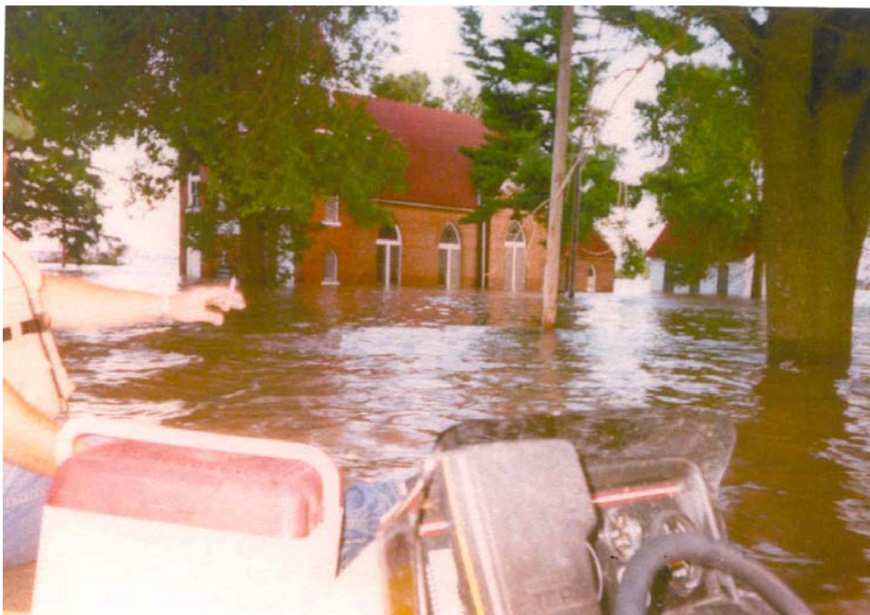
Figure 4: Historic photograph taken July 25, during the Flood of 1993