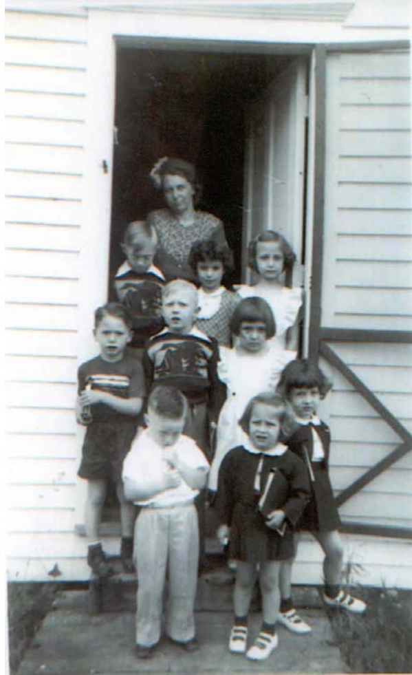
Figure 2: Historic photograph (taken about 1950), showing a Sunday School class in the doorway of the schoolhouse

Section number 8 Page 13 St. John's Evangelical Lutheran Church and Parochial School Holt County, MO