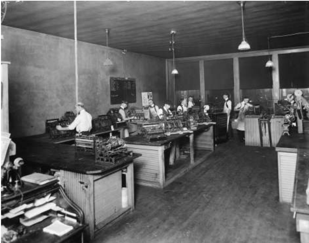
Figure 1: Repair Shop, National Cash Register Building, St. Louis.

Name of multiple listing (if applicable)