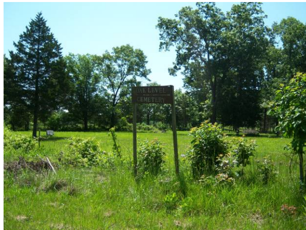
Oak Level Cemetery, looking southeast.