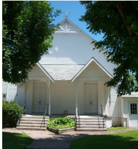
Hams Prairie Christian E. side SR AD, N. of CR 424, Hams Prairie