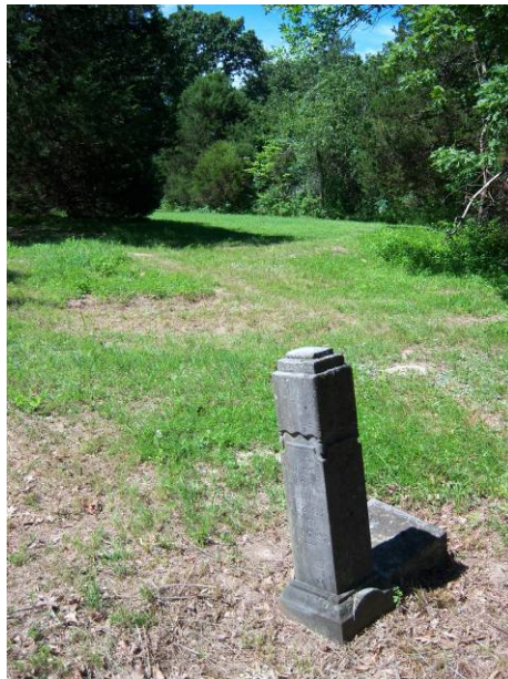
Whetstone New Era Baptist Cemetery

Whetstone New Era Baptist, CR 164 approx. ¼ mi. west of CR 163, Williamsburg vic.