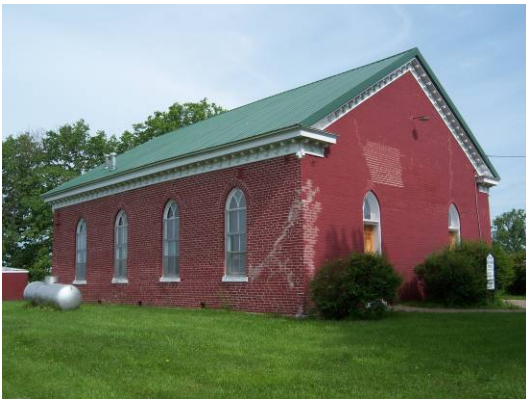
Concord Presbyterian W. side CR 245 at CR 282, Auxvasse vic.