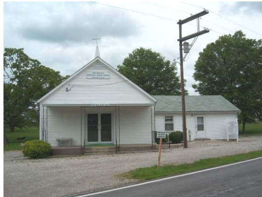
New Richland Baptist W. side SR HH S. CR 220, Kingdom City vic.

During the course of the survey of Callaway County's rural churches, six gable-end churches were identified as being essentially unaltered: