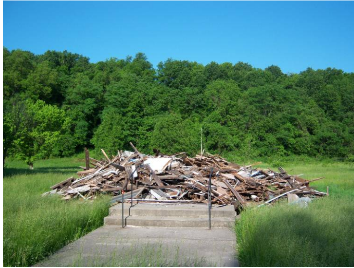
Ruins of Wainwright Methodist Church

Westminster Presbyterian Church, NE Corner of SR M and CR 263, Hatton