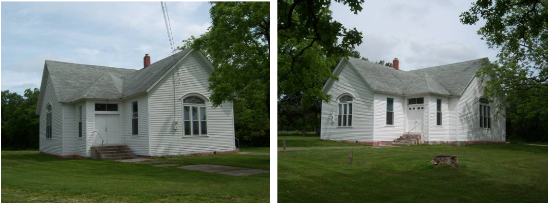
Liberty Christian, S. side CR 744 approx ½ mi W. of SR N, Shamrock vic. (two views)