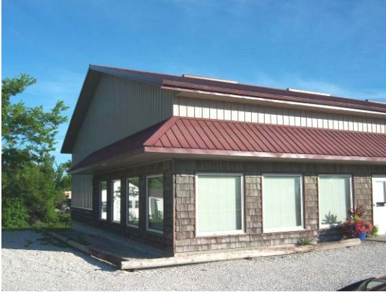
Freedom Christian SR J, New Bloomfield