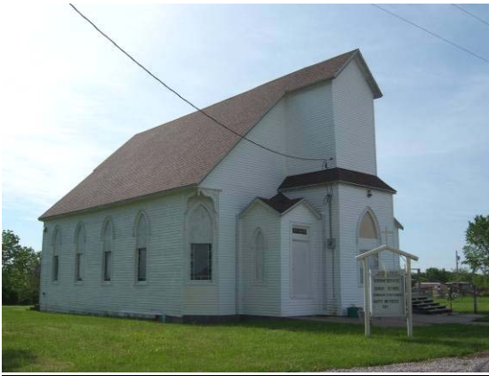
Hickory Grove Christian Church SE corner of CRs 299 & 2000, northwest Callaway Co.