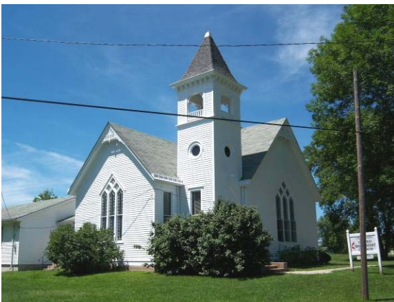
McCredie United Methodist Church CR 240, Kingdom City