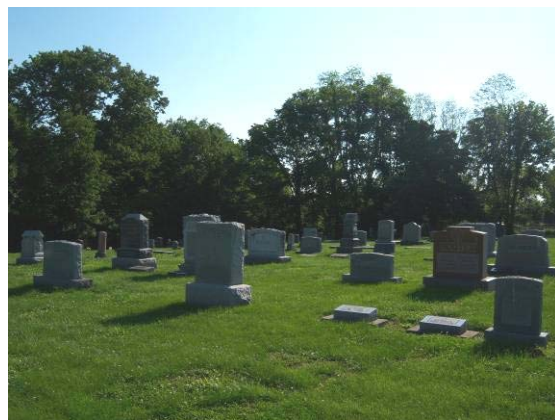
Riverview Methodist Church Cemetery, two views.