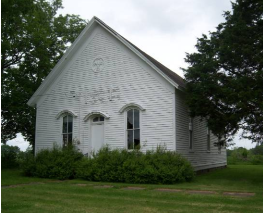
Richland Christian 5301 CR 220, Kingdom City vic. (NR 2/16/2001)