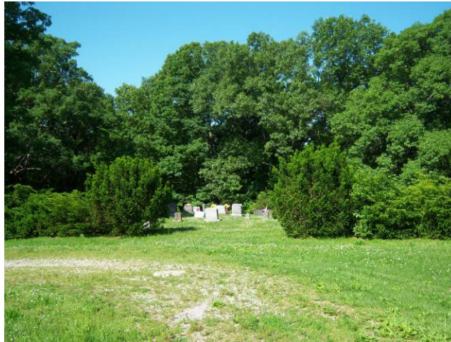
Riverview Church of God, looking west.

Organized in c. 1870, the church closed in 1982.