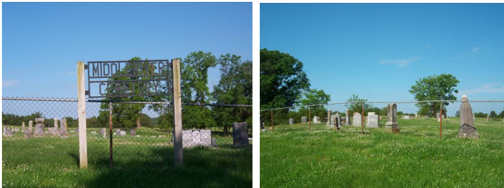
Middle River Cemetery