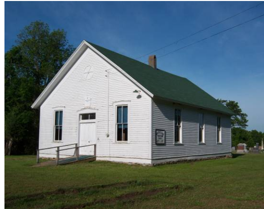
White Cloud Presbyterian SR F at jct. with CR 232, south side, Fulton vic.