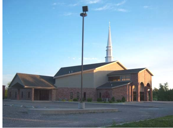
Union Hill Baptist 406 S. Summit Dr., Holts Summit