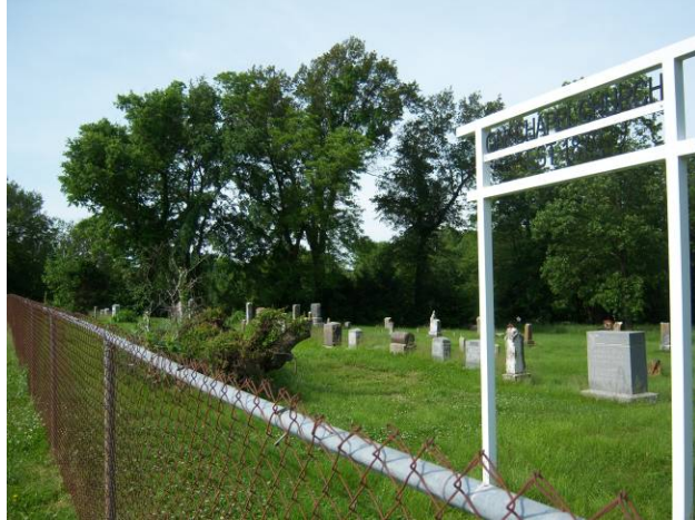
Oak Chapel Methodist Cemetery, looking southwest.