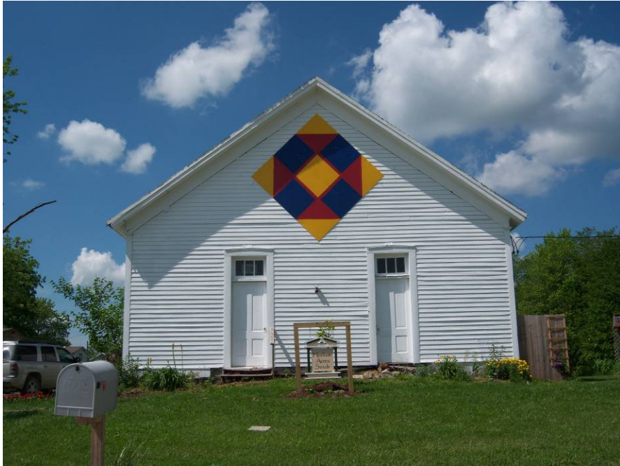
Church building in Guthrie, 2529 CR 338, Guthrie