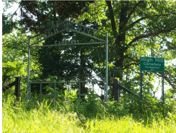
High Hill Cemetery