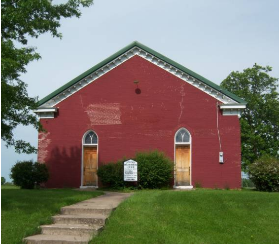
Concord Presbyterian W. side CR 245 S. of CR 282, Auxvasse vic.