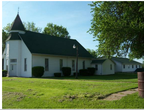
Millersburg Baptist Church S. Side SR WW, W. of jct w/ SR J, Millersburg