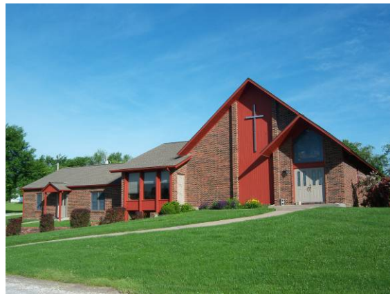
Millersburg Christian, 4527 SR J, Millersburg