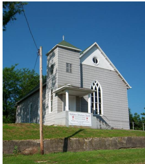
Mokane Christian Church Fulton Ave., N. of Oak St., Mokane