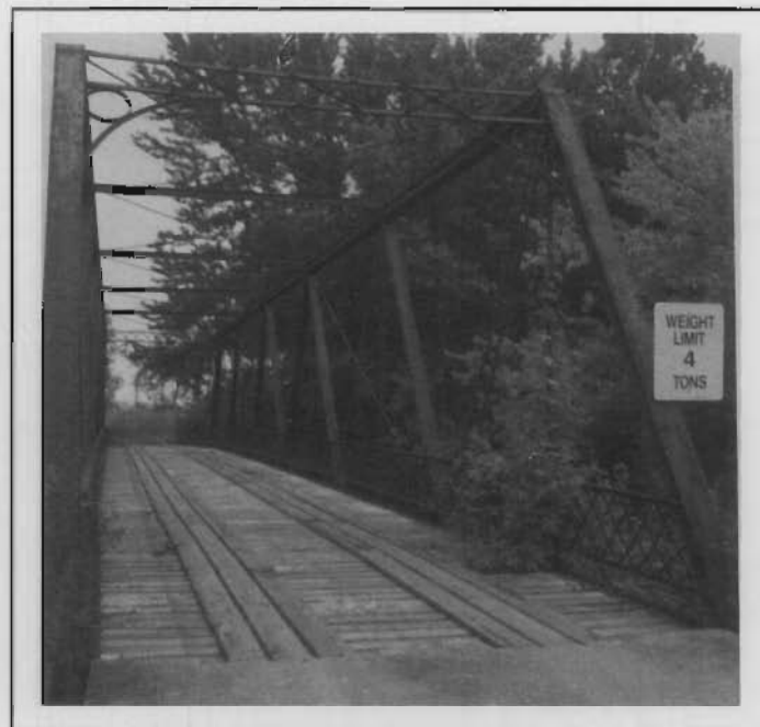
Henkins Ford Bridge, two miles north of Catawba, 1887, King Iron Bridge Company, Cleveland, Ohio.