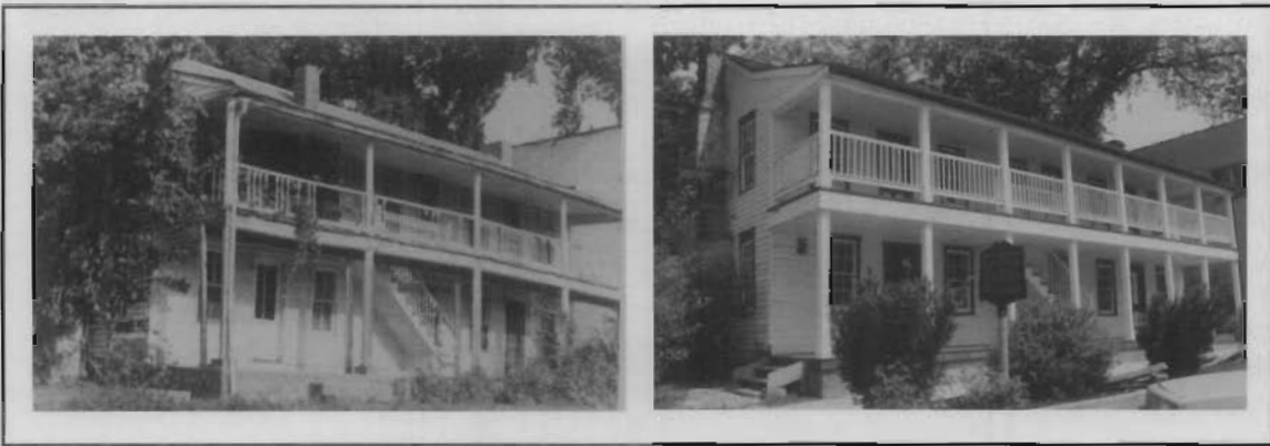
The Old Stagecoach Stop had been abandoned and vacant for 20 years when it was purchased by the foundation in 1983.