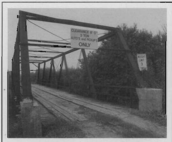
Mud Creek Bridge, two miles northeast of Braymer, 1887, King Iron Bridge Company, Cleveland, Ohio.