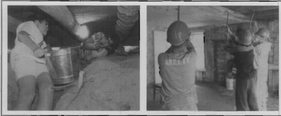
A LEAP student holds up a broken glass goblet found under the building during the salvage excavation.

Jan Primas teaches grades 3–5, and Terry Primas teaches grades 6–8 in Waynesville R-VI Schools' LEAP, 339 School St., Waynesville, MO 65583.