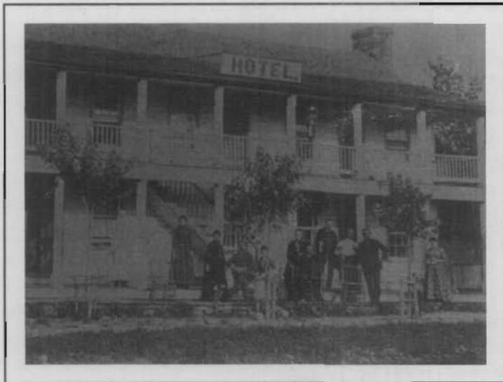
The Old Stagecoach Stop was being operated as a hotel when this photo was taken by an unknown photographer in 1900.

In what may be Missouri's most innovative museum/school partnership, the Old Stagecoach Stop in Waynesville becomes a learning laboratory for a multi-disciplinary educational program.