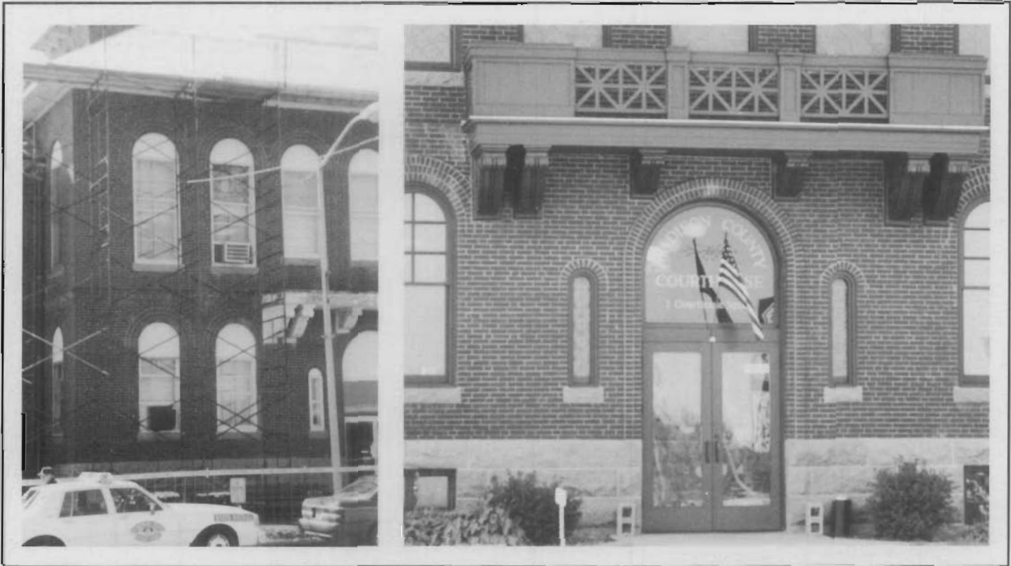
The north elevation before rehabilitation (left), and after (right), demonstrates the importance of windows and doors as character-defining features. Note also, the beautifully reconstructed balcony.

percent-plus boilers connected in series (and staged to operate only on demand); a new 35-ton, energy-efficient chiller; and a new, four-pipe, heating and cooling system to allow for heating and cooling only where needed, the project became eligible to receive a low-interest loan from the Missouri Department of Natural Resources' Division of Energy. The department's Historic Preservation Program (HPP) provided technical assistance throughout the project.