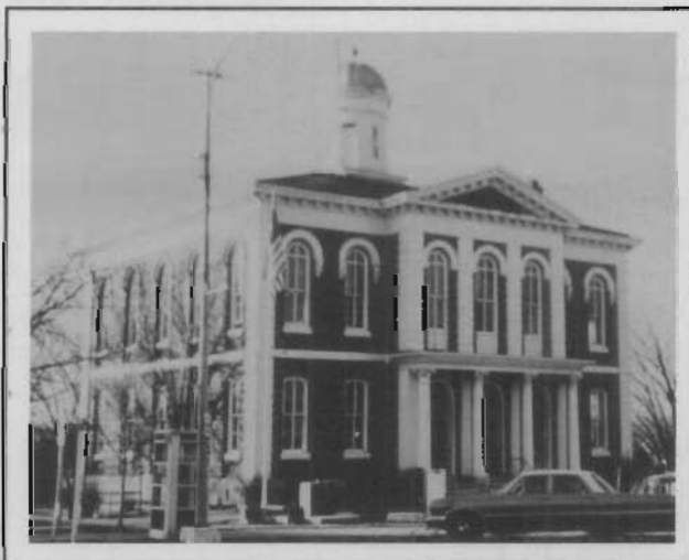
The Warren County Courthouse prior to its demolition in 1995.

It is hoped that by examining what happened to the courthouse in the last years of its life, all who are interested in the preservation of their local landmarks will learn how to begin planning now to ensure a future for their past.