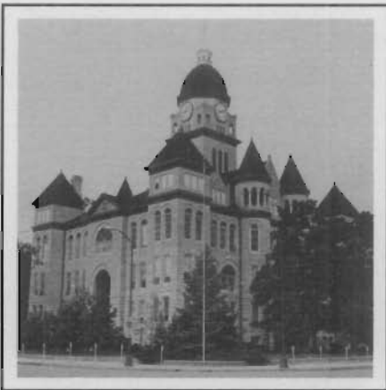
The Jasper County Courthouse, Carthage (1895), is a fine example of Romanesque architecture, a predominant style used in the construction of Missouri's courthouses between 1891 and 1906. Of the 15 courthouses in the state that are considered Romanesque, Jasper County's is the most typical and best preserved of the style. Alterations have been minimal and are sympathetic to the original design. — Allen Tatman