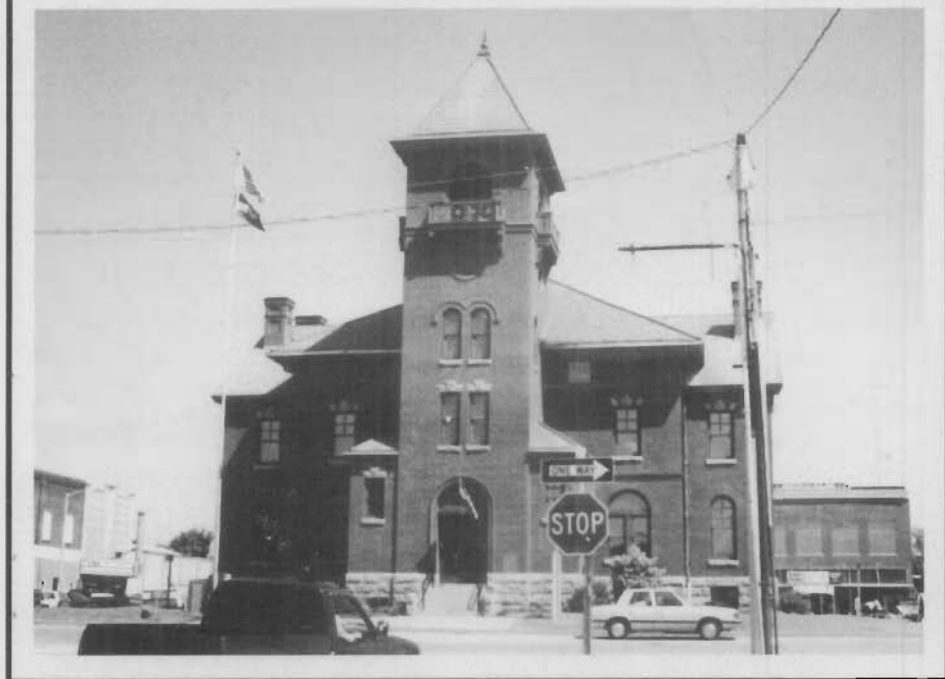
The Madison County Courthouse was showing its age and years of neglect in the top photo. Note the variety of non-historic window infill and the modern metal balustrade on the tower balconet. With rehabilitation complete (bottom photo), the courthouse is once again the pride of Madison County.