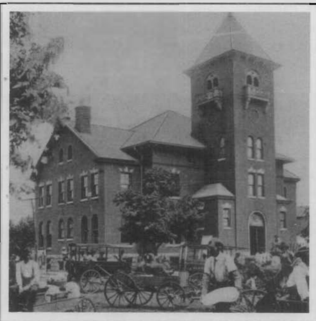
The citizens of Madison County gathered in front of the courthouse in Fredericktown for this 1906 photograph.