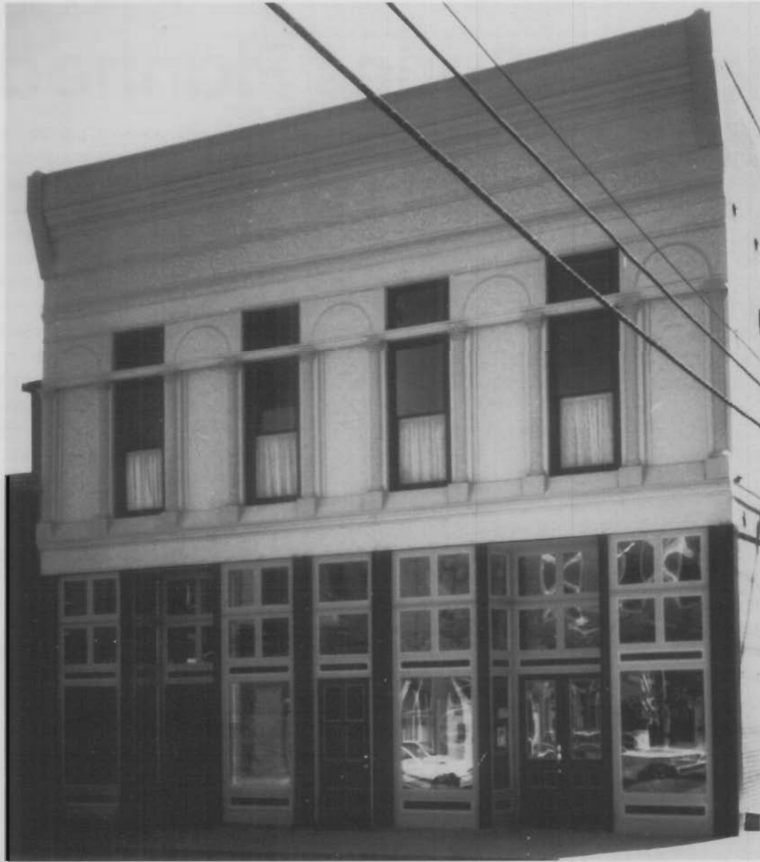
Historic Clarksville, Inc.'s most recent project was the former I.O.O.F. Hall. The second story meeting room now serves as a community center. A new elevator (only the second in the county) provides accessibility.