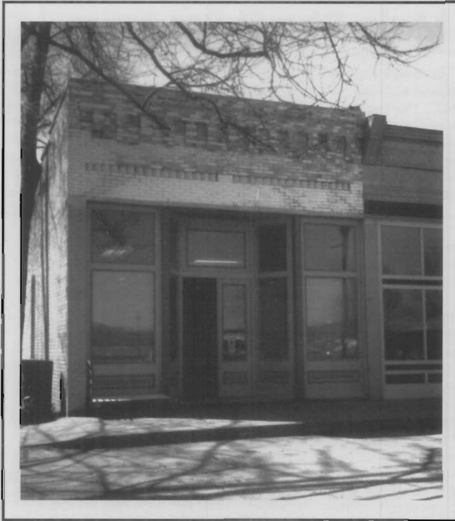
This recently rehabilitated building is the new headquarters for a local construction company.