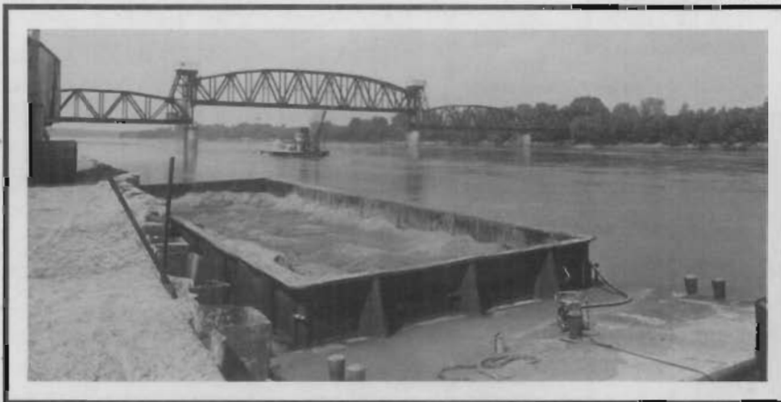
MKT Bridge #3 at Boonville spans the Missouri River linking Howard and Cooper counties. It was built by the American Bridge Company in 1930-31. Besides having four truss spans totaling 1,147 feet, which help make it the longest MKT bridge, it also has a 408-foot lift span which, when built, was the longest in the world.