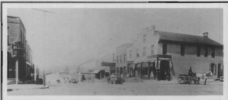
Westport Road at Pennsylvania Ave. in Westport as it appeared in 1892. The Santa Fe Trail proceeds from foreground to background at center. Albert Boone's store is at far right.