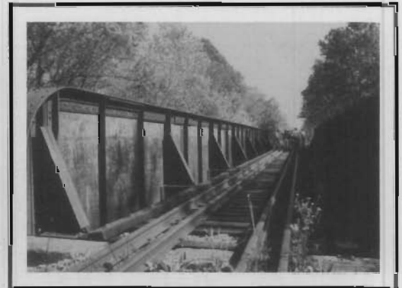
MKT Plate Girder (11) crossing the Middle Fork of the Tebo Creek in Henry County was built as a through girder by the Wisconsin Bridge and Iron Company in 1925.