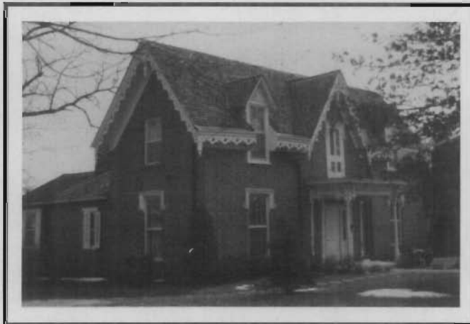
Closely associated with the Santa Fe Trail, the Overfelt-Campbell-Johnson House (ca 1850) in Independence is an important early example of a Gothic Revival-style house. Note the characteristics that define the style: steeply pitched cross gabled roof; decorative vergeboards; and drip mold window lintels.

Ten Missouri properties are being nominated for their associations with the Santa Fe Trail, as a nationally significant commercial and transportation network. Five historic trail sites, two mill sites, and three houses comprise the Missouri nominations.