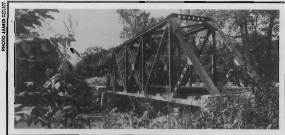
MKT Bridge #7 over the Little Bonne Femme Creek in Boone County is a Pratt through truss with riveted connections built by the A&P Roberts Company in 1898.