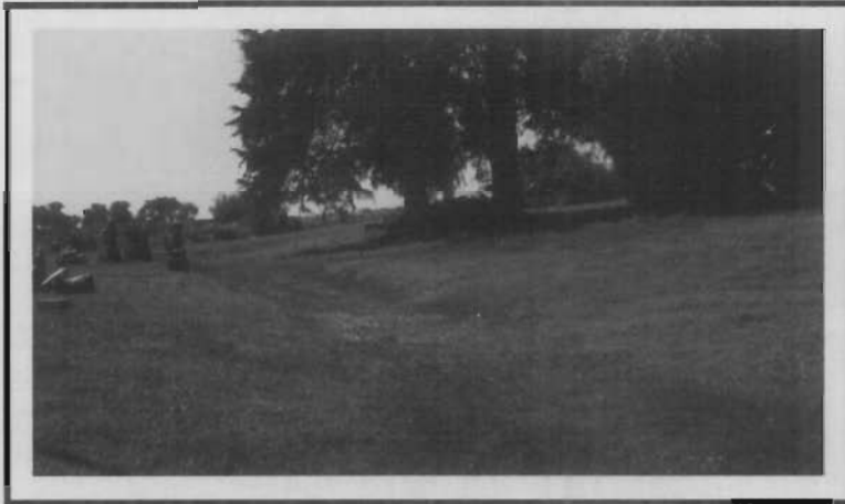
This rutted trail segment is located in Maple Hill Cemetery near Grand Pass, Saline County.