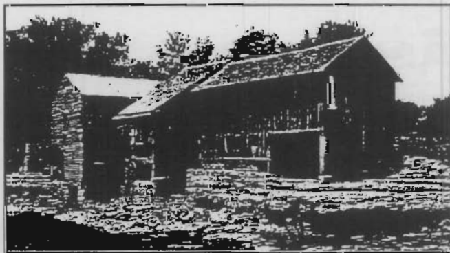
Although it was demolished in 1953, the stone foundations of the old Fitzhugh-Watts' Mill (1834) remain on the west bank of Indian Creek at 103rd Street in South Kansas City. The mill site is being nominated to the National Register for its association with the Santa Fe Trail.

The three houses being nominated as part of this project are not located on the route of the Santa Fe Trail but have direct historic associations with commerce on the trail due to their historic owners. All three houses are located in Independence. The Smallwood V. Noland House is an I-