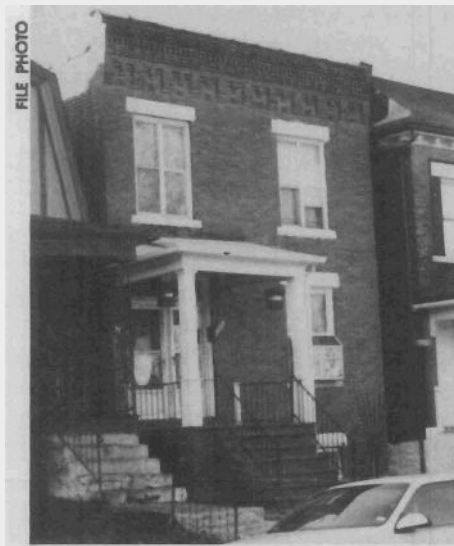
The Shelley House, St. Louis, Missouri