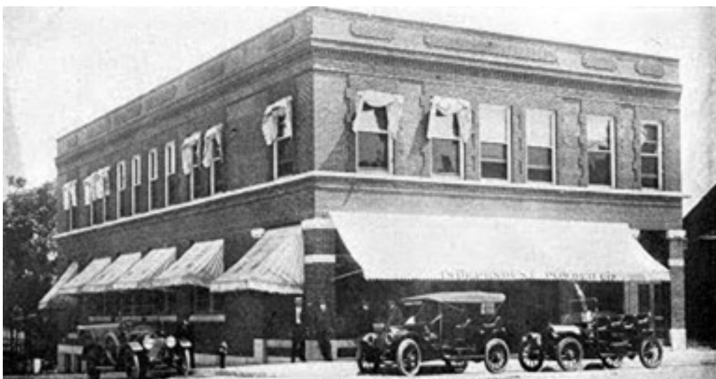
Fig. 2 This view of the Independent Building (Resource No. 2) appeared in a 1913 promotional booklet for Joplin. The addition on the right (east) side occurred much later but was complete by 1923, as shown in Fig. 4 [from the Post Memorial Library Collection]