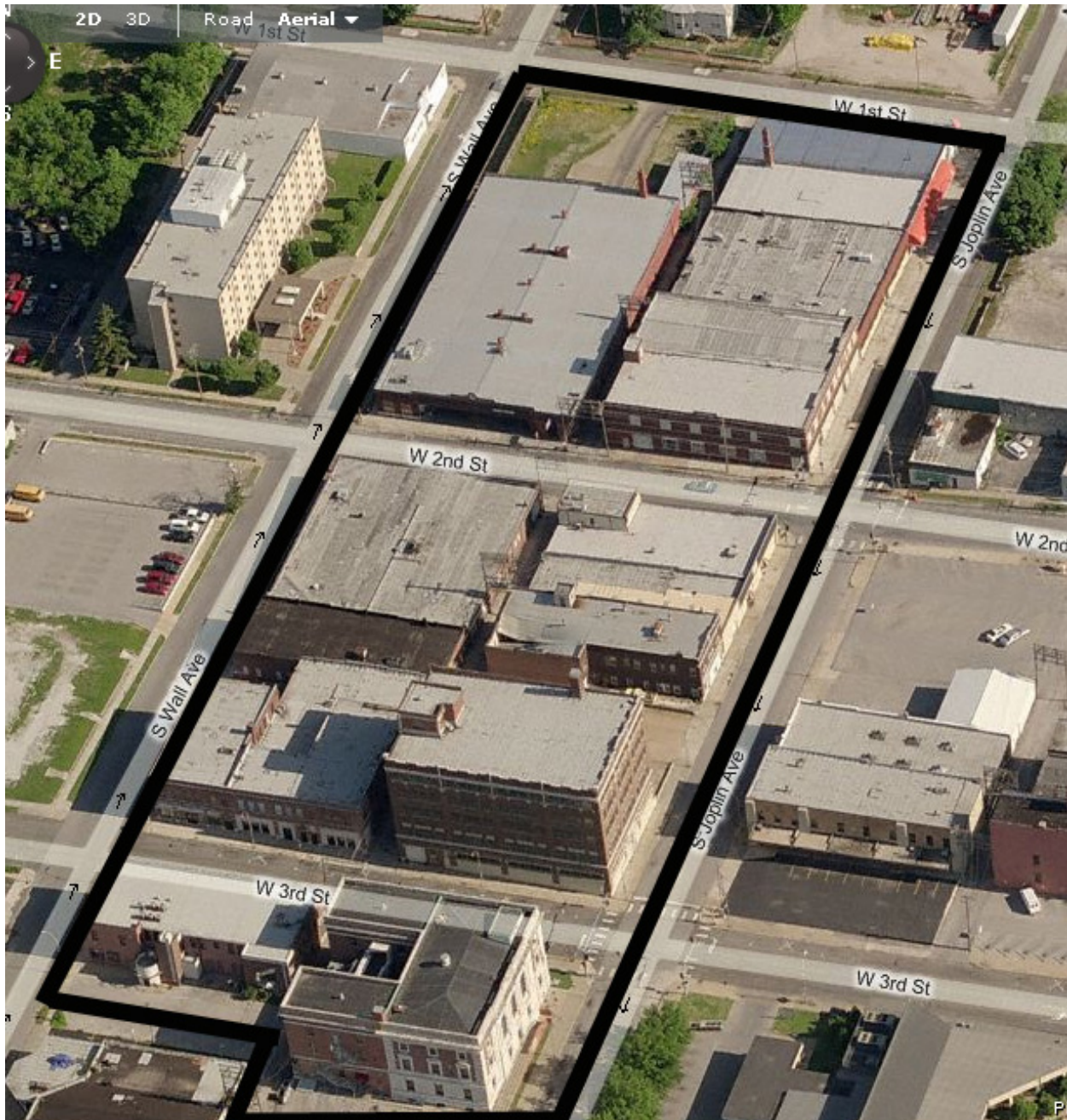
Fig. 5 This aerial view of the district illustrates the character of the district itself as well as the property immediately outside of the nominated area, as described in the boundary justification.