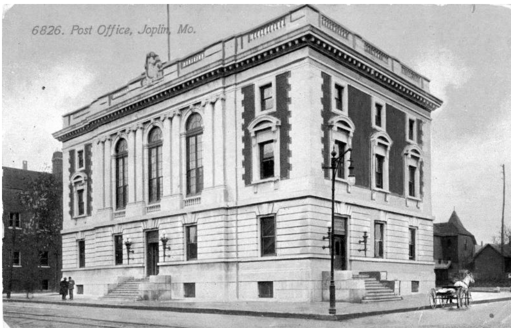
Fig. 3 This post card view of the U. S. Court House and Post Office (Resource No. 2) was likely published shortly after the building's 1904 completion and also shows the property immediately to the west which would eventually include the 1936 addition to the Post Office and the Cosgrove Building (Resource No. 1).