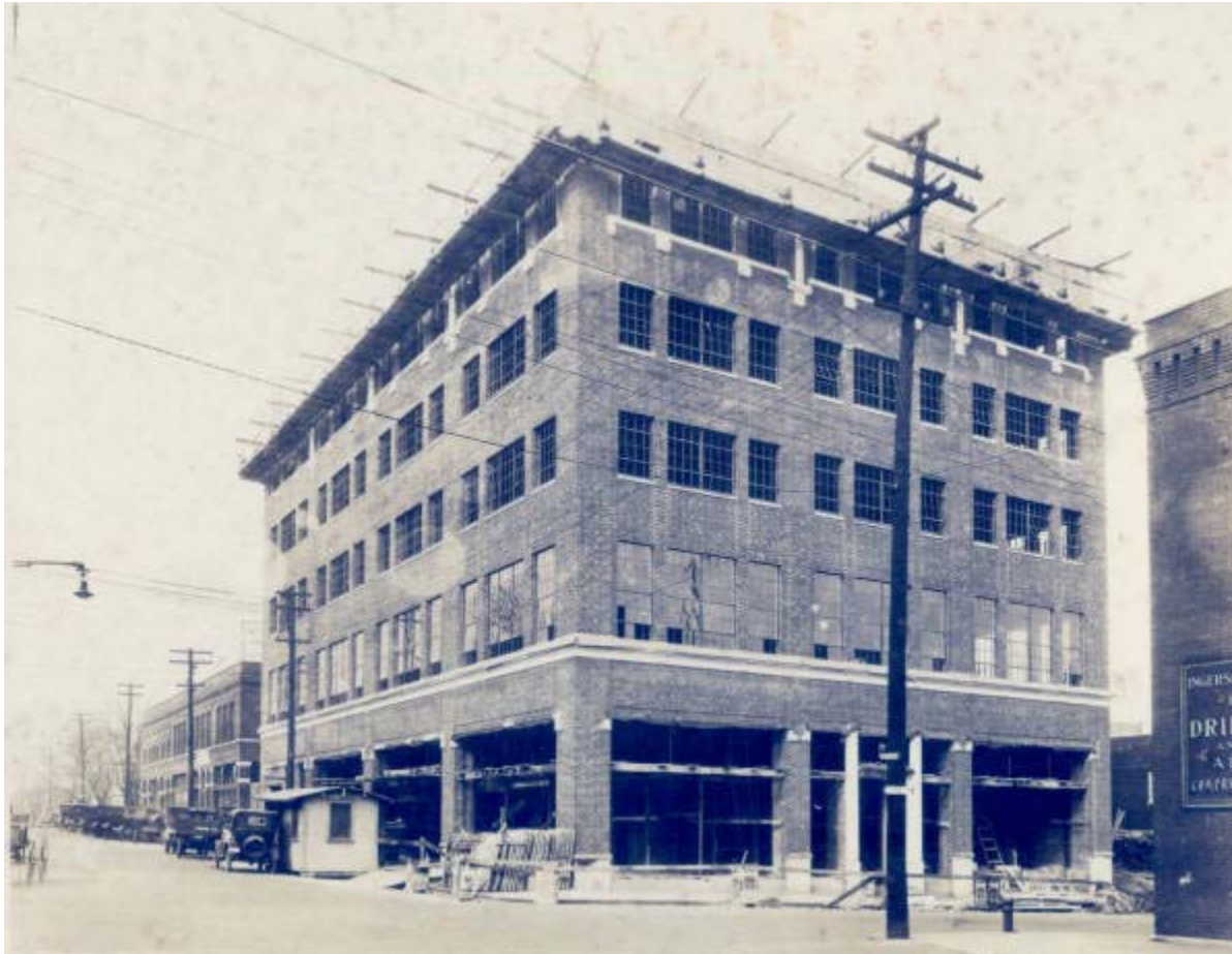
Fig. 4 This 1923 photo shows the Joplin Supply Company building (Resource No. 13) under construction as well as the Independent Building (Resource No. 2) which by that time had already assumed its present size as compared to the image shown in Fig. 2.