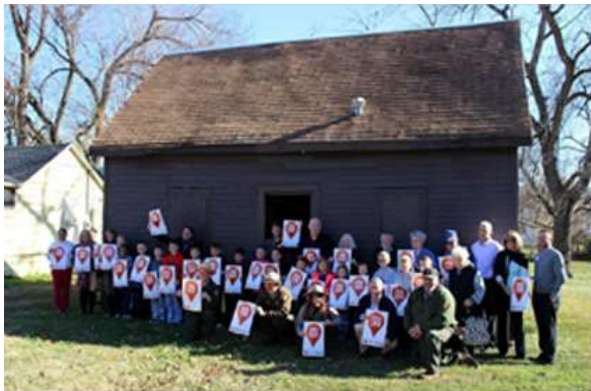
Left: The Neosho Colored School, 1871; photo is ca. 2012.