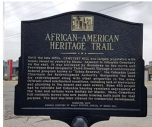
Above: One marker on the African American Heritage Trail in Columbia commemorates Cemetery Hill, a largely Black neighborhood that fell victim to urban renewal in the late 1950s. The photo on the left, which appears on the marker, shows houses that originally stood in the area which is now a large commercial development. Some 450 people, many of them homeowners, were displaced with few options due to the segregated housing conditions of the time.