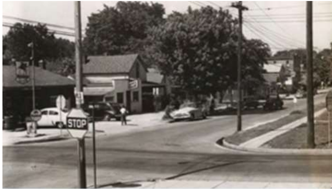
Left: Lafayette Street prior to urban renewal.