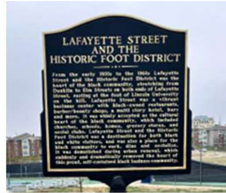
Right: The historic marker erected in 2022 commemorating the Legacy District.