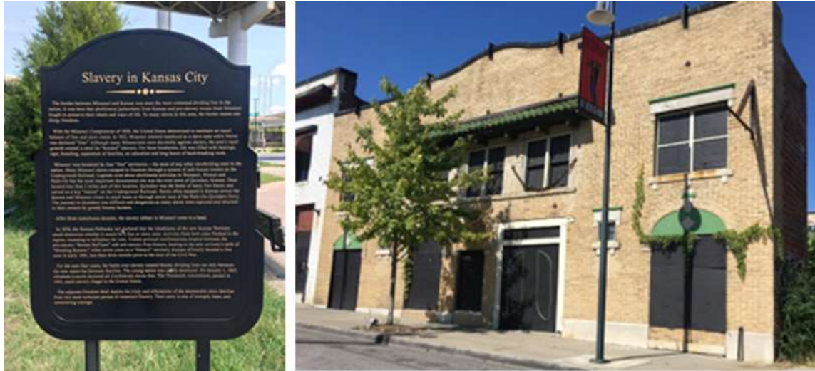
Left: The West Bottoms Freedom Trail Memorial; Right: The Eblon Theater (1922)

Comprising some 115 sites, the African American Heritage Trail of Kansas City ( https://aahtkc.org/aahtkc-sites ) is a virtual trail because the number and land area of sites along the Trail are too large to walk. This impressive website is a well-researched and thoroughly documented history of the city, and its contributors include UMKC, the Black Archives of Mid-America and the Kansas City Public Library.