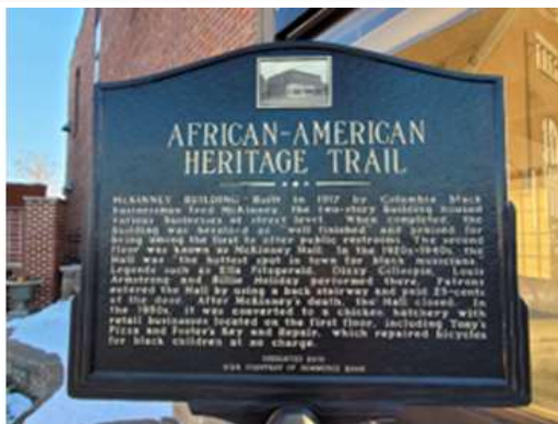
Left: The McKinney Building, Columbia, 1917, built by Black businessman Fred McKinney.