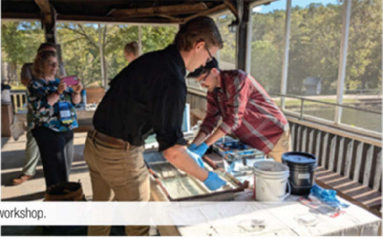
Top Left and Right: steel window workshop.