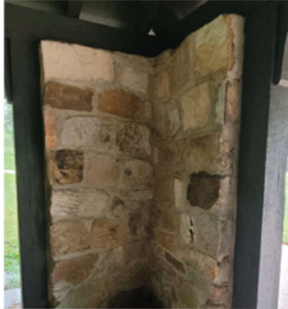
Exterior (left) and interior (right) of an Ozark rock masonry support wall of the Alley Pavilion at the NPS Alley Spring campground. The photo on the right shows typical "giraffe" construction with flat sandstone slabs.

Note: Jo Schaper points out that an example of "giraffe" masonry can be found on the National Park Service's Route 66 website; see https://www.nps.gov/places/rock-fountain-court.htm .