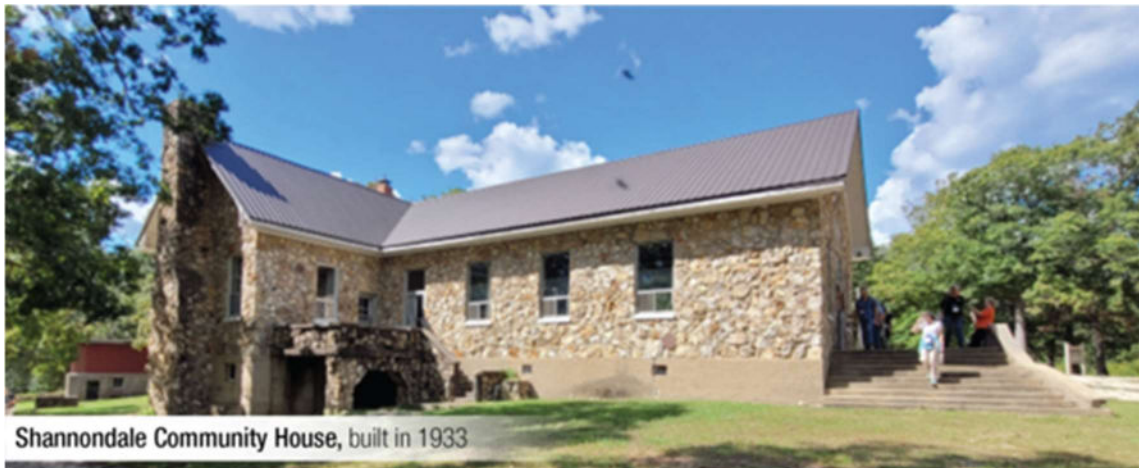
Shannondale Community House, built in 1933

Ozark rock masonry has been used for many building types including religious, residential, commercial, civic and public buildings. In Shannon County, the two main examples we explored during the Missouri Preservation Annual Meeting were religious structures: the Shannondale Community House, built in 1933, and the Mount Zion Church in Akers, which was completed in 1948.