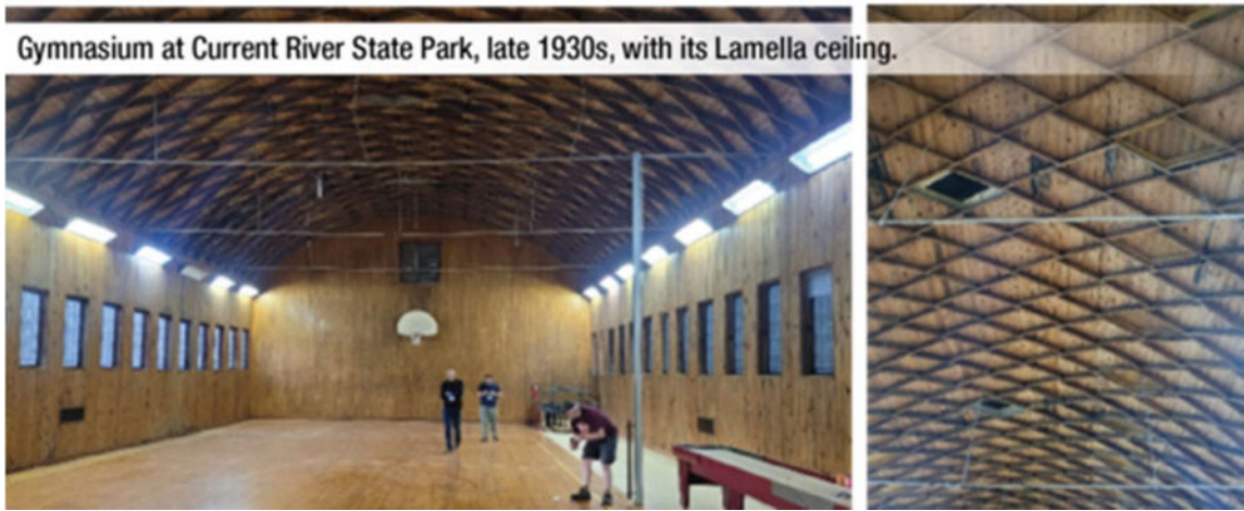
Gymnasium at Current River State Park, late 1930s, with its Lamella ceiling.