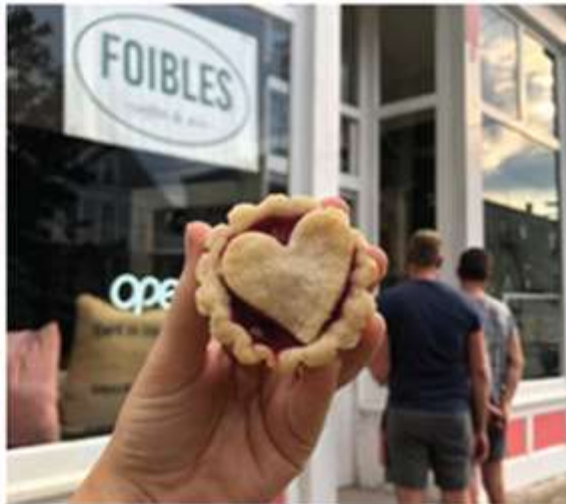
Foibles Coffee & Pie, Buffalo, New York.

“Help champion the world of small-scale development as much as you can,” Radle advised. She offered several tips for building the ecosystem for small scale developers: 1) grow your own developers in your town; 2) organize monthly meet-ups for small developers to meet, network and support one another; 3) embrace legacy shopfronts and 4) infill vacant lots and do it well. She talked about raising money to close financing gaps and to provide a revolving loan fund to kick-start small projects. “The secret to a great city, town or neighborhood is that it is built by many hands,” she added, emphasizing that small-scale developers need to feel