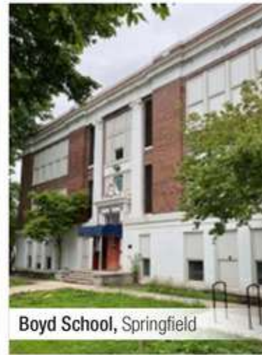
Boyd School, Springfield