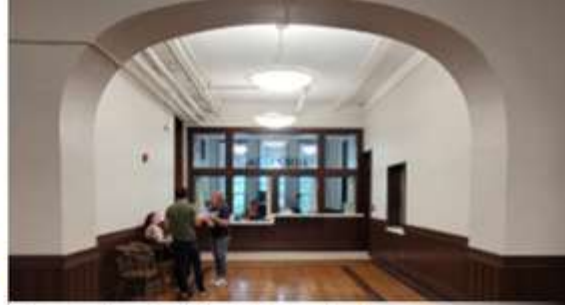
Jasper County Courthouse, Carthage