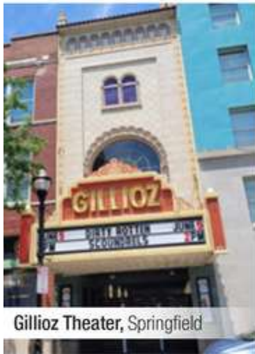
Gillioz Theater, Springfield