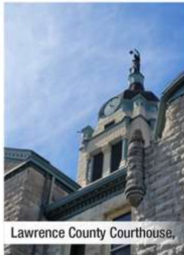
Lawrence County Courthouse,