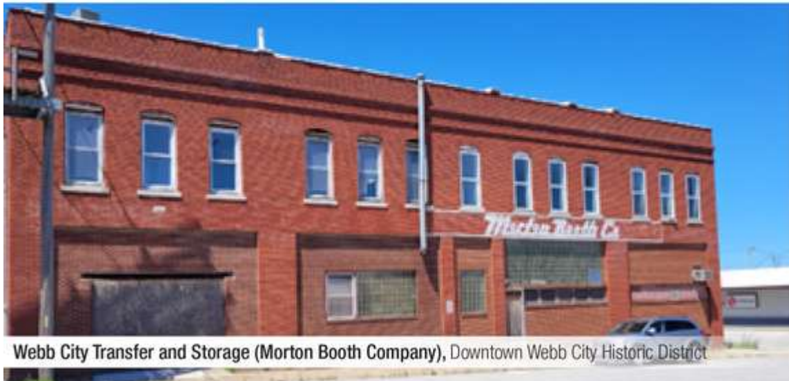
Webb City Transfer and Storage (Morton Booth Company), Downtown Webb City Historic District