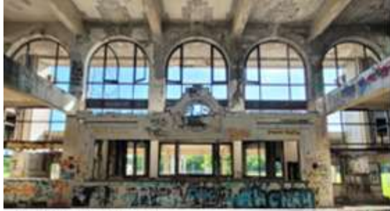
Joplin Union Depot