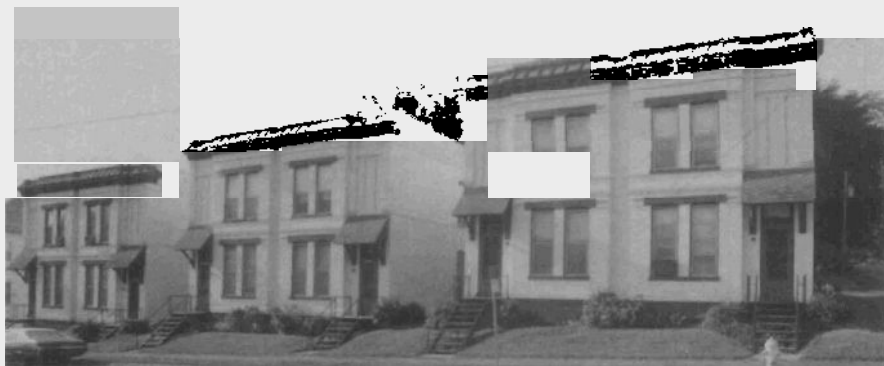
Museum Hill Historic District