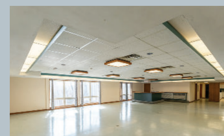
Hickory Ridge Conference Center, Meramec