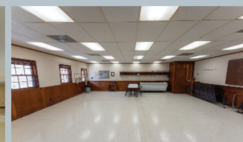
Searcy Building, Montauk