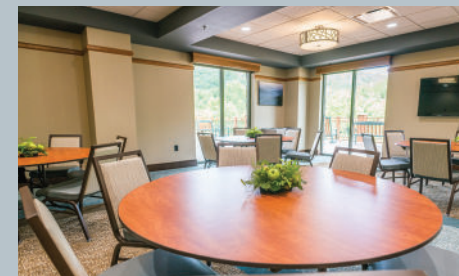
Betty Lee Lodge, Echo Bluff