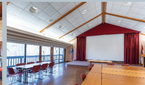
Owls Eye Theater, Dr. Edmond A. Babler Memorial