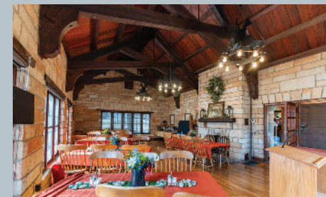
Dining Lodge, Bennett Spring

20431 State Hwy 157 Kirksville MO 63501-7069