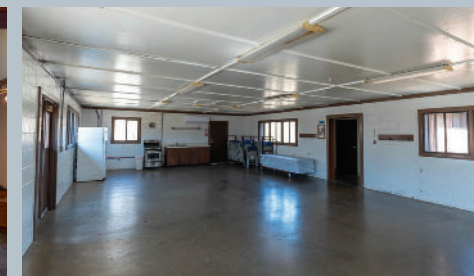
Enclosed Shelter, Thousand Hills