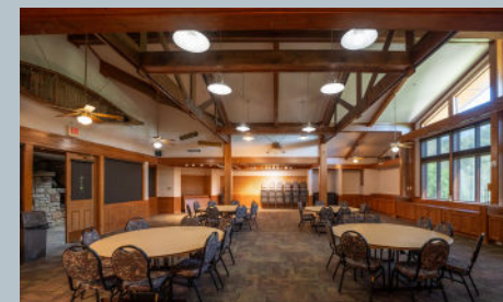
Emory Melton Inn, Roaring River